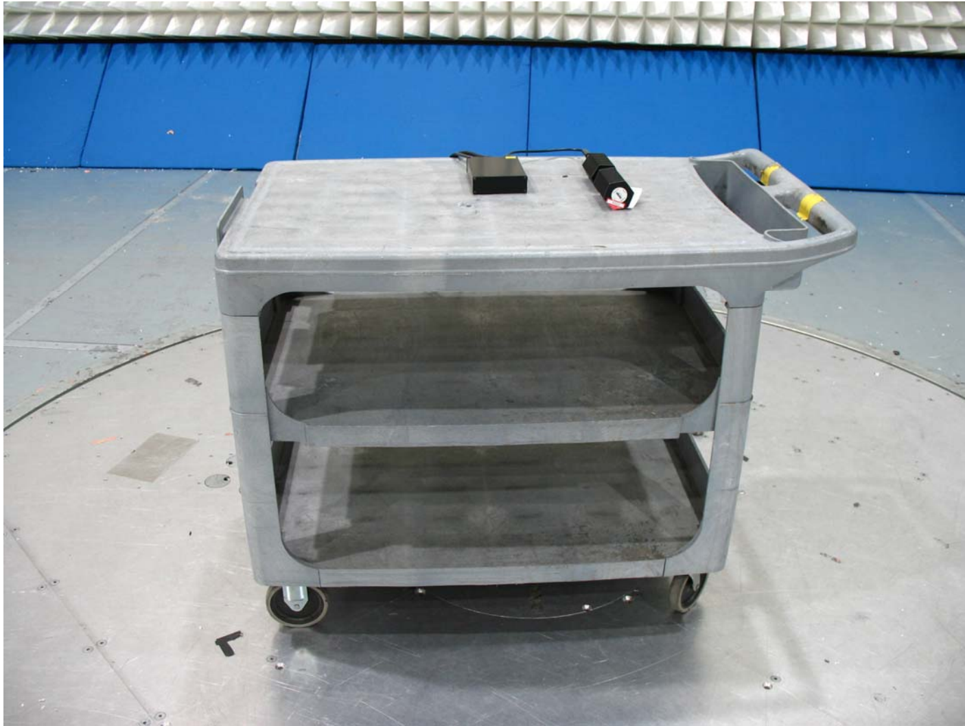
Radiated Testing, Front Side