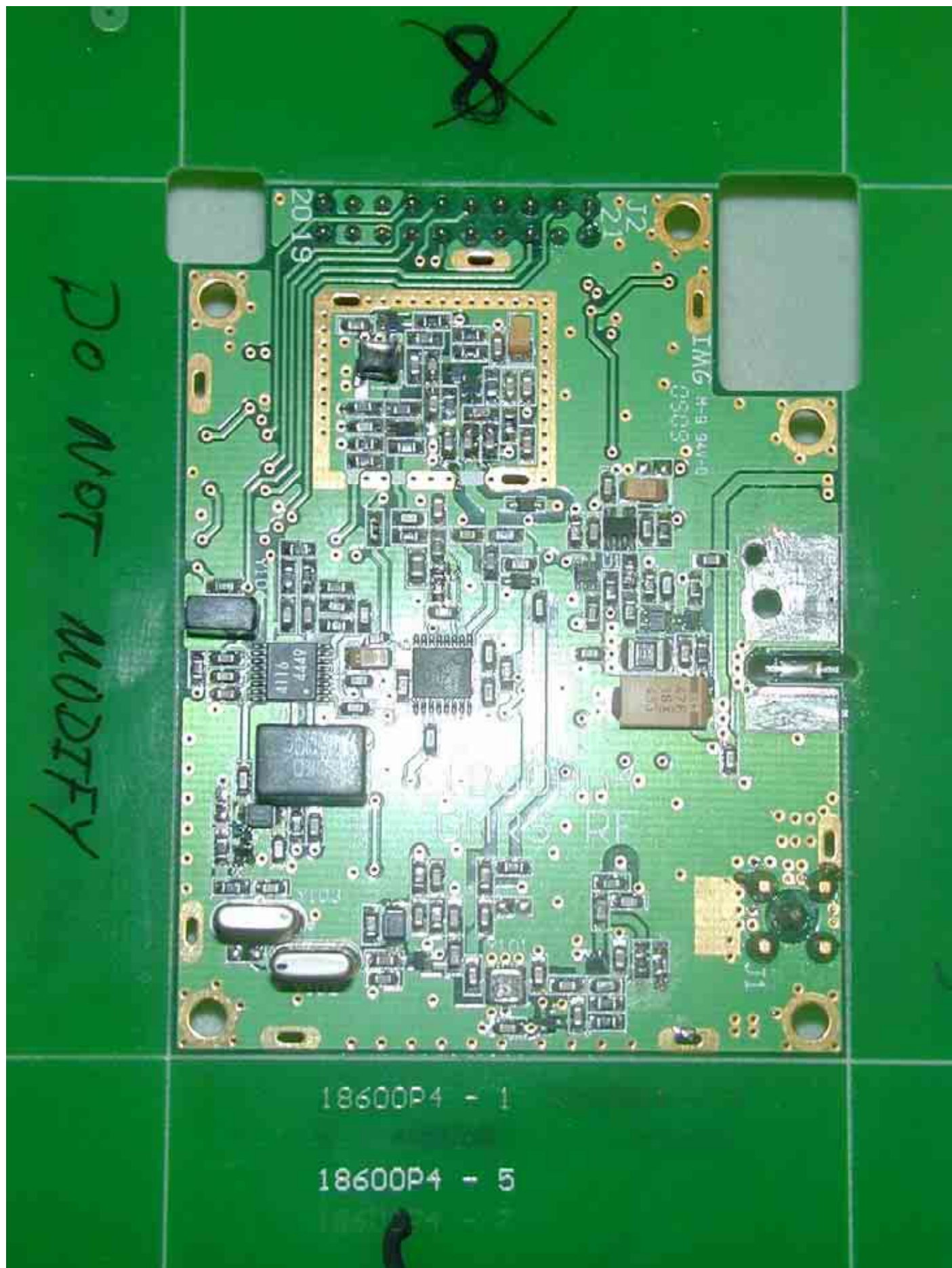
Figure 7: Transmitter Board Under Shield