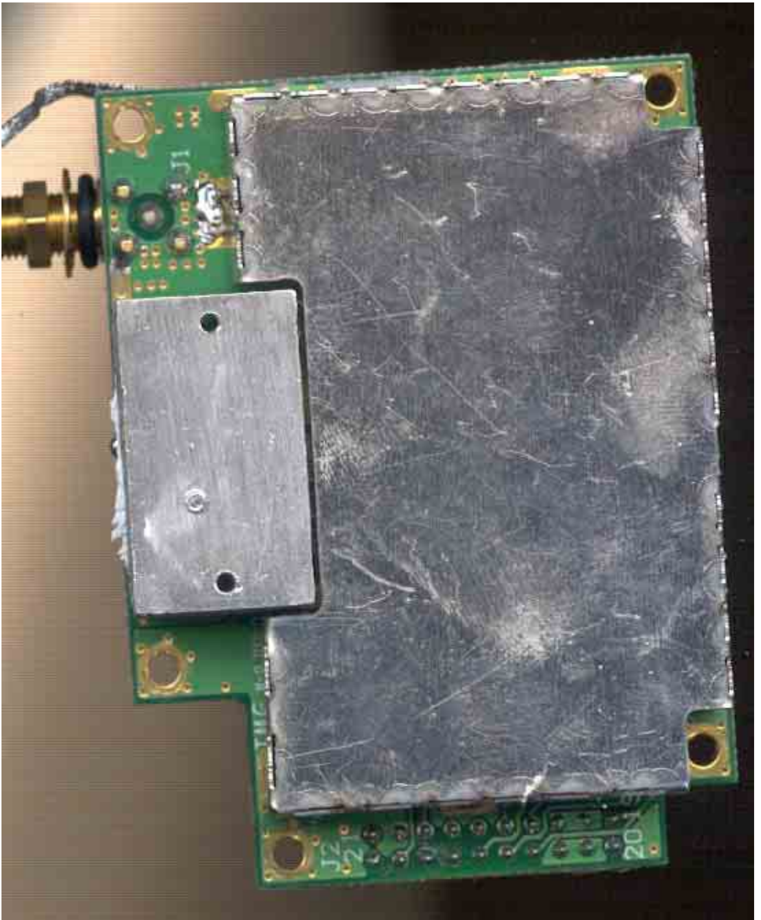
Figure 6: Transmitter Board Back