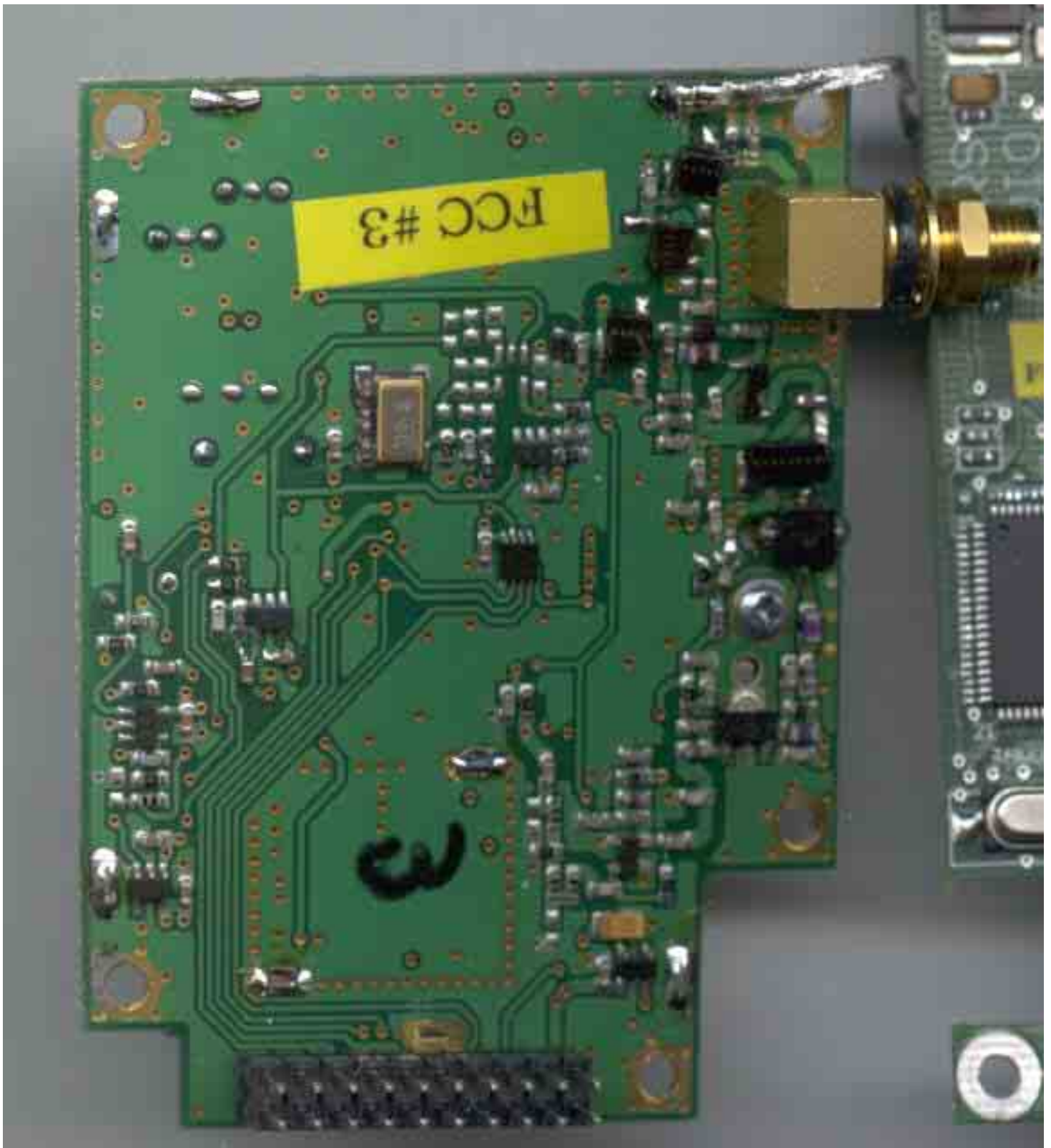
Figure 5: Transmitter Board Front