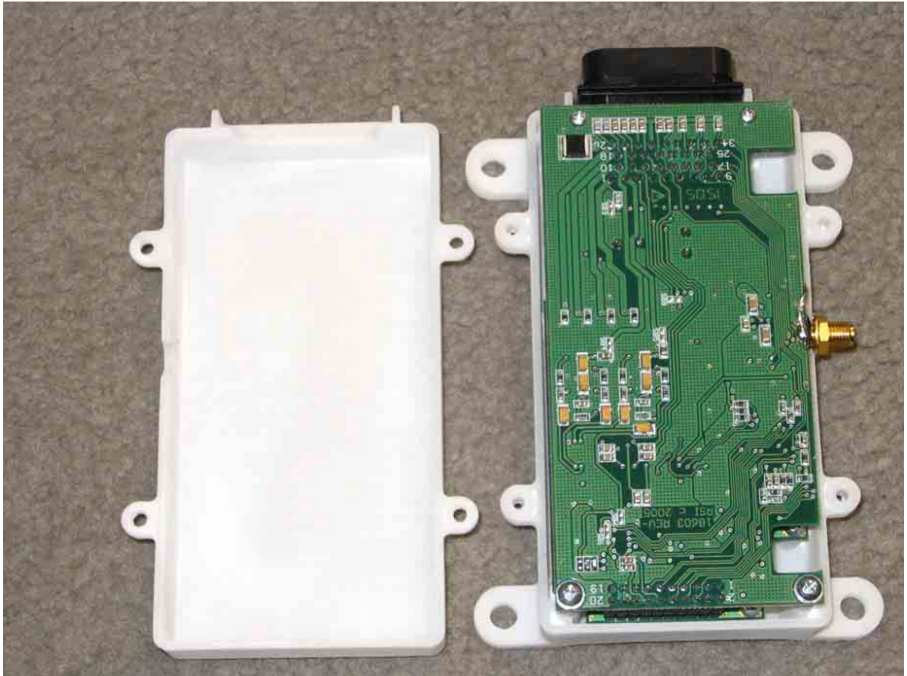
Figure 1: GMSH Taken Apart