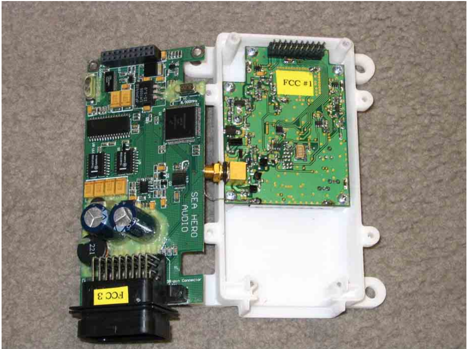
Figure 2: GMSH Taken Apart #2