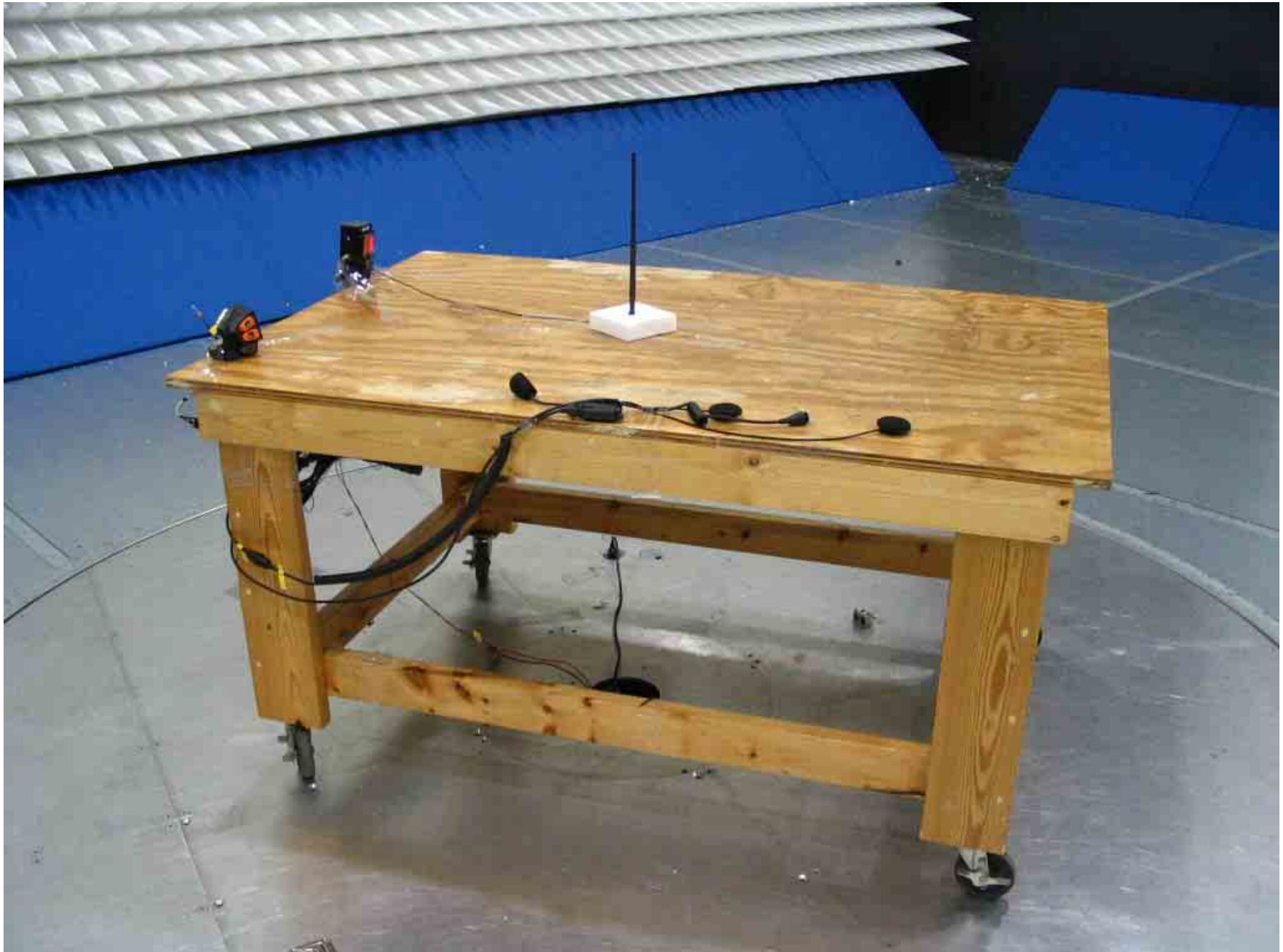
Figure 3: Radiated Testing #2