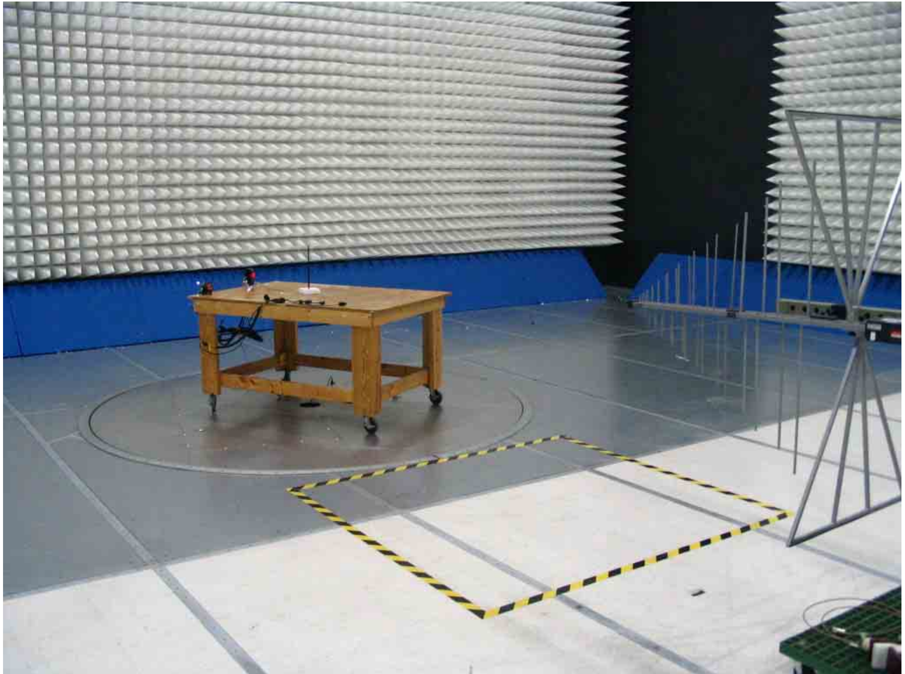
Figure 2: Radiated Testing