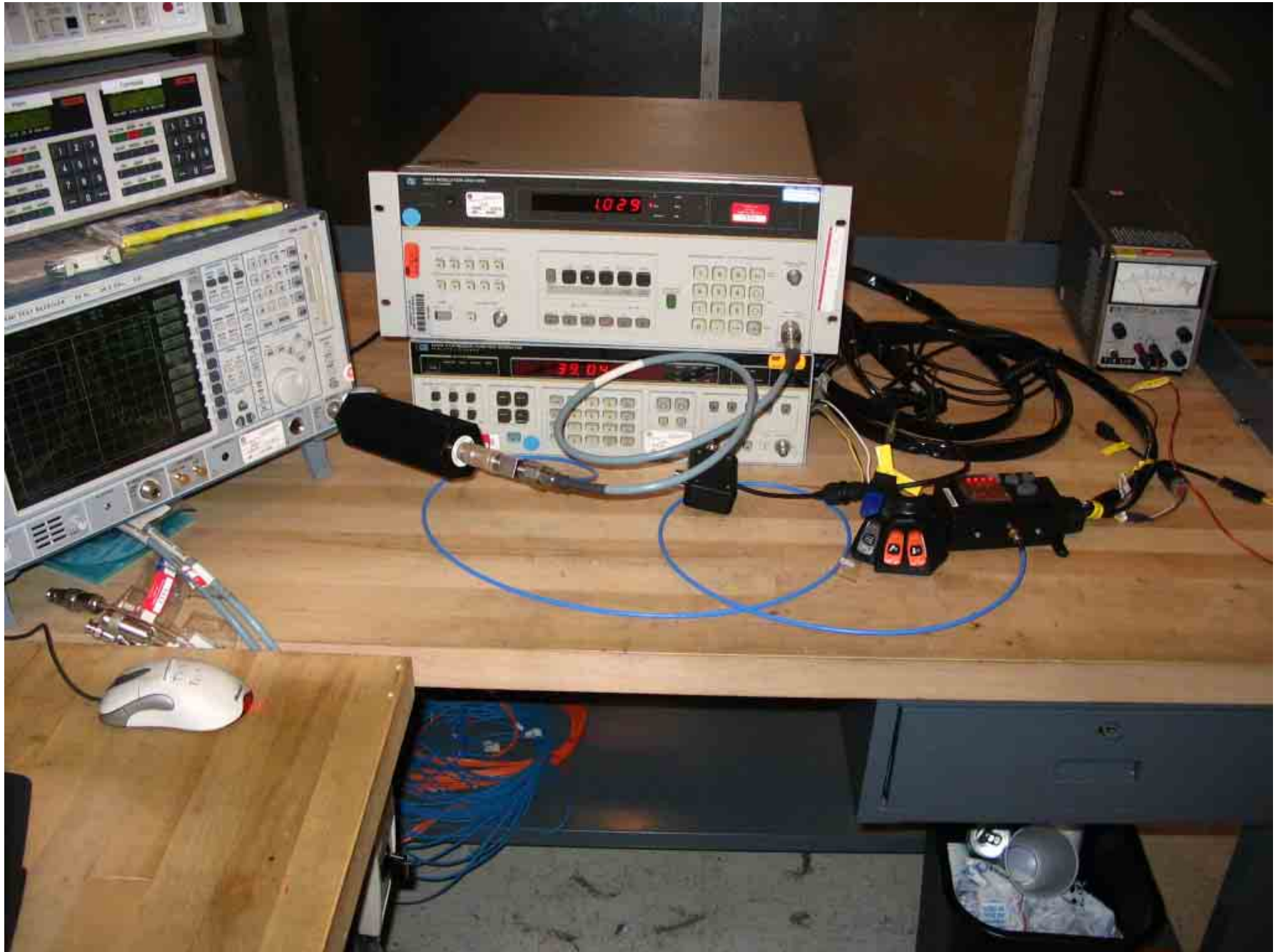
Figure 1: Conducted Testing