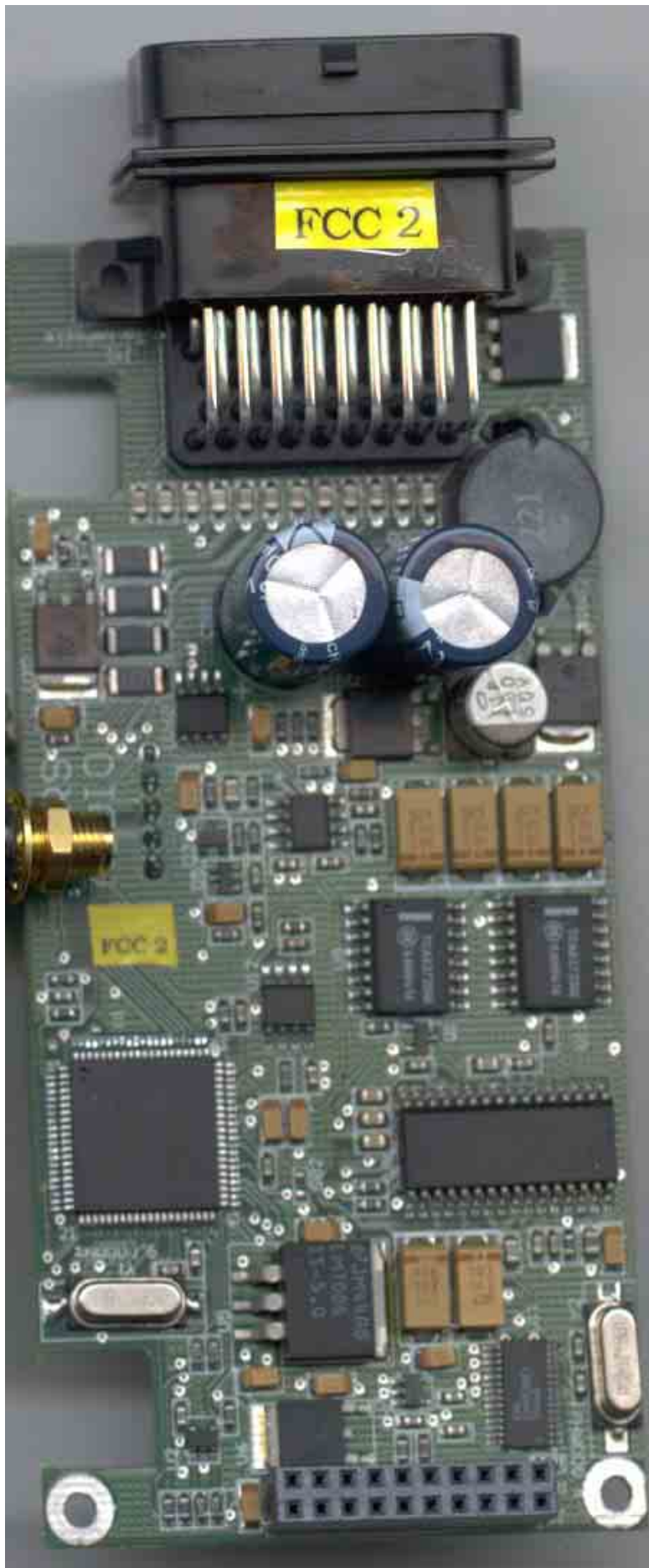
Figure 3: Audio Board Front