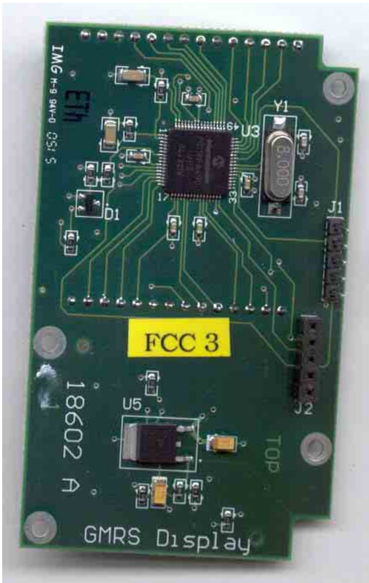
Figure 6: Display Board Back