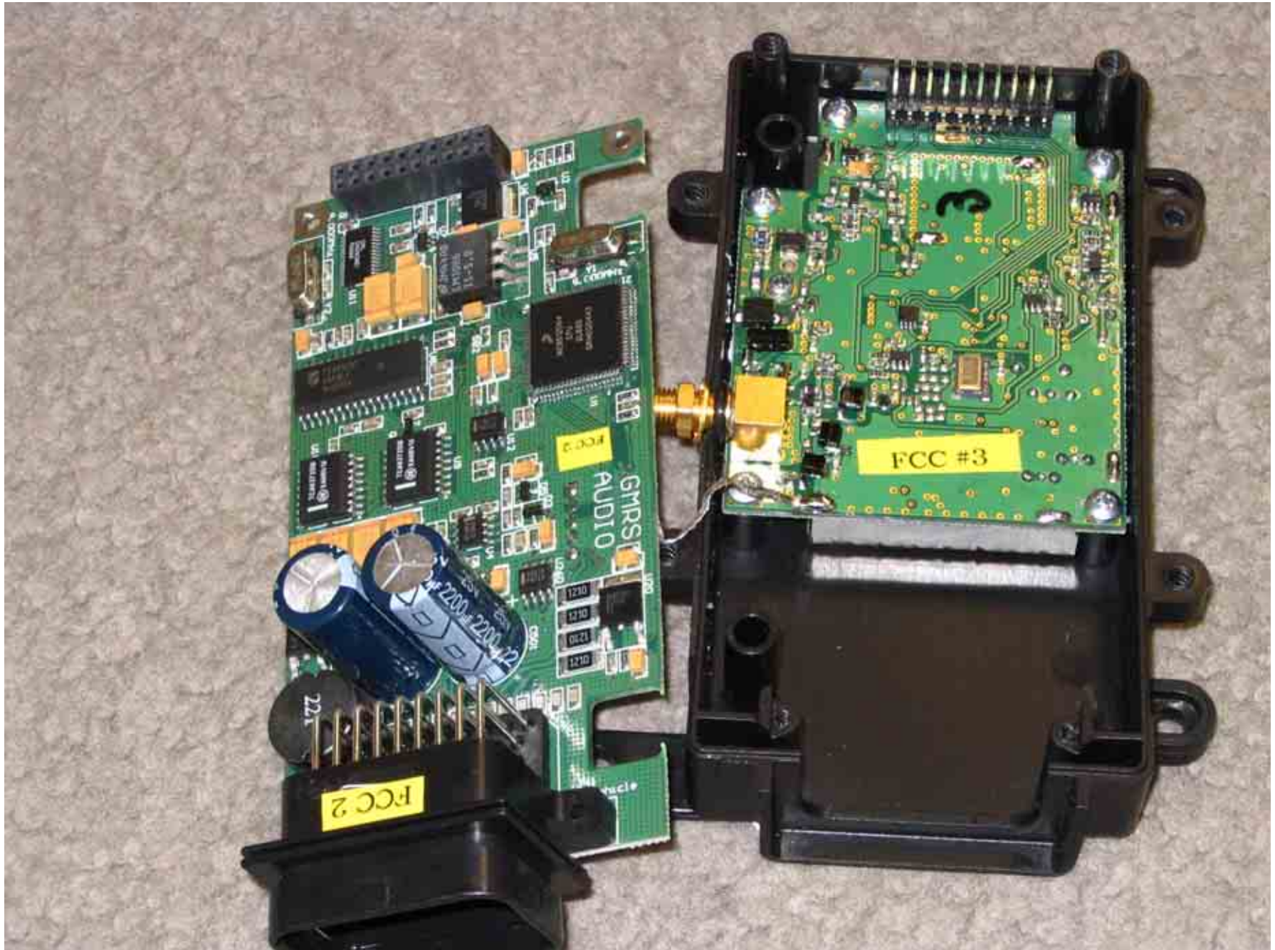
Figure 2: GMRO Taken Apart #2