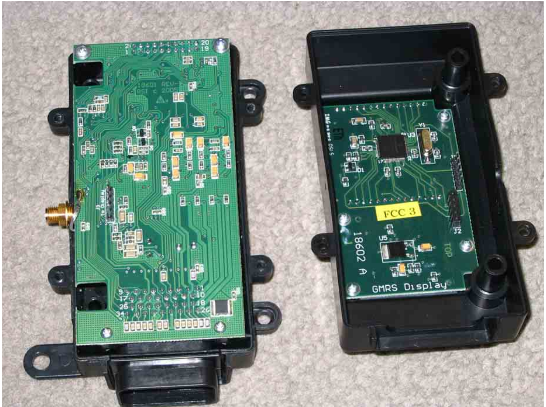
Figure 1: GMRO Taken Apart