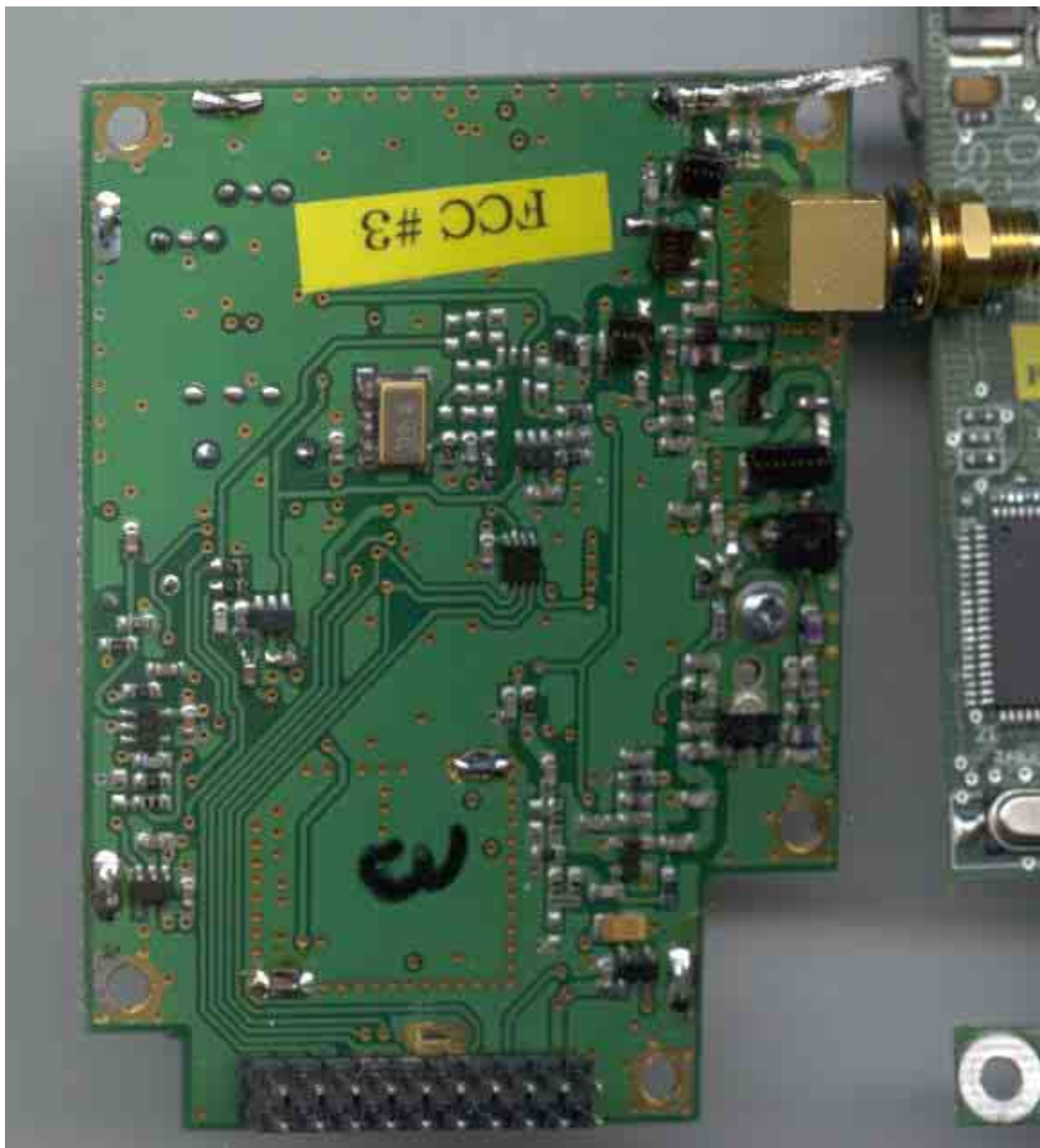
Figure 7: Transmitter Board Front