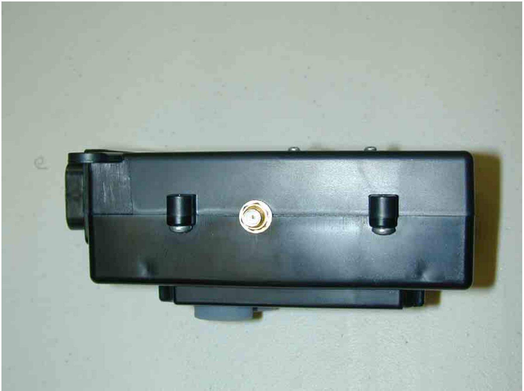
Figure 5: GMRO Antenna Connection Side