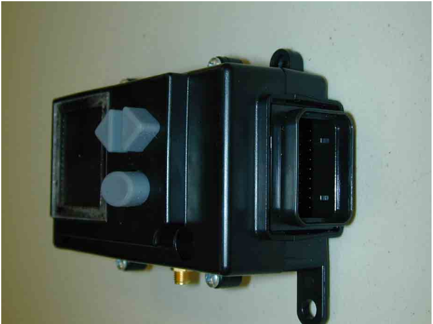
Figure 4: GMRO Wiring Harness Side