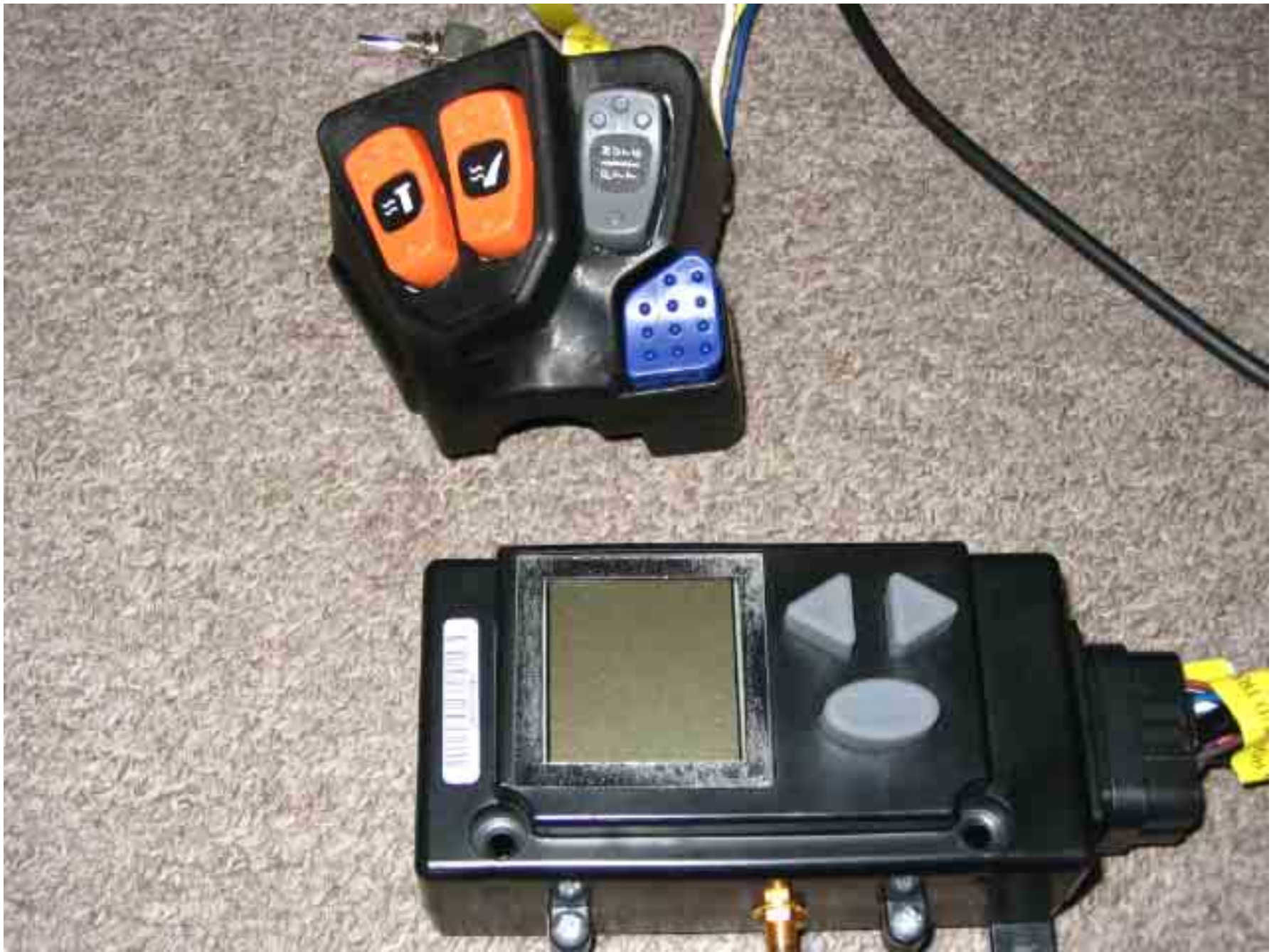
Figure 2: GMRO with Handlebar Controls