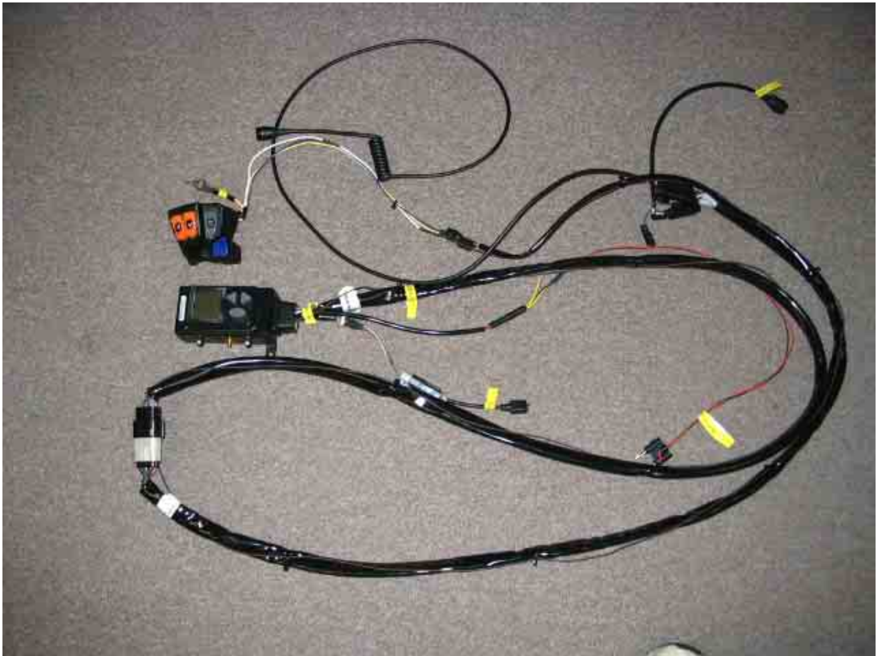
Figure 1: GMRO with Wiring Harness and Handlebar Controls