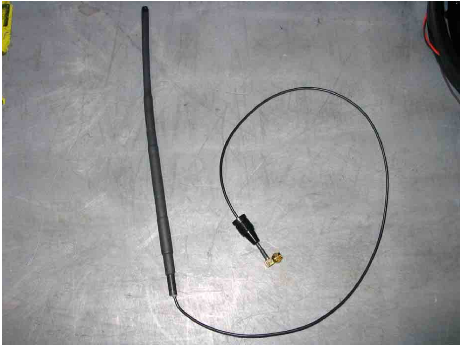
Figure 6: Sleeve Dipole Antenna with Connecting Cable