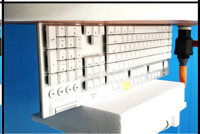
Bottom Side of EUT Tested at 0 mm