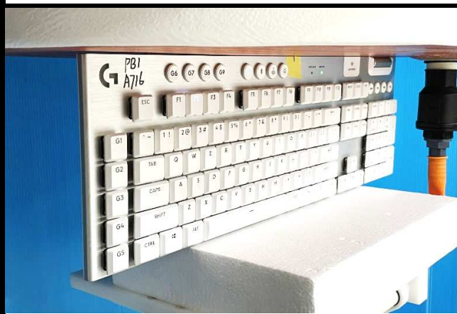
Top Side of EUT Tested at 0 mm