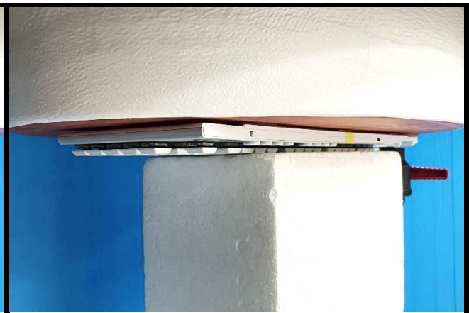
Rear Face of EUT Tested at 0 mm