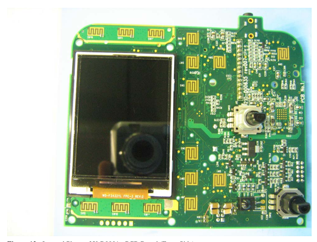
Figure 12: Internal Photo of X-R0001 - PCB Board (Front Side)