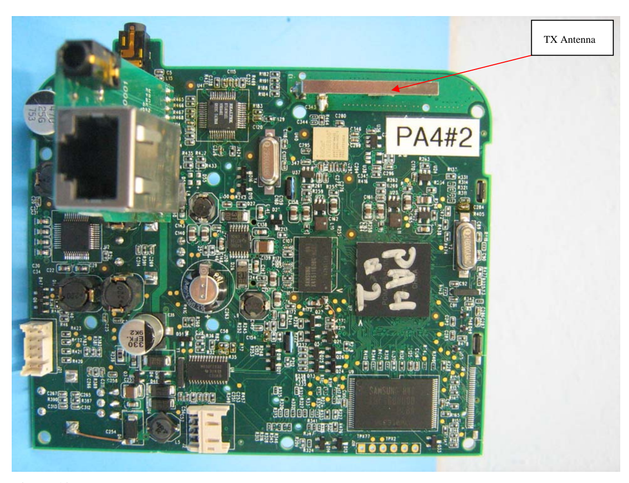
Figure 13: Internal Photo of X-R0001 - PCB Board (Rear Side)