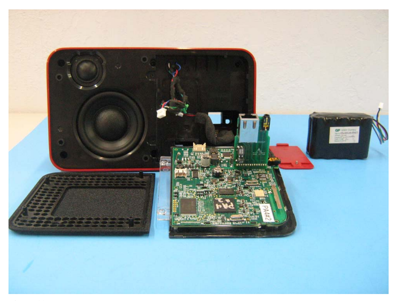
Figure 11: Part Photo of X-R0001