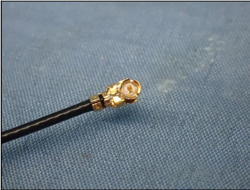
ANT 1 (Brand: FIH / Model: PCB)