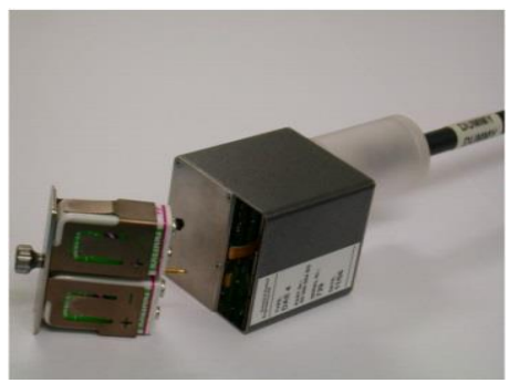
Fig 5.1 Photo of DAE

The input impedance of the DAE is 200 MOhm; the inputs are symmetrical and floating. Common mode rejection is above 80 dB.