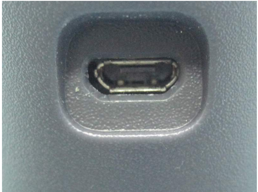
Power Adapter 1 Model No. AD631MC P/N No. 534-000542 (Power cable with core)