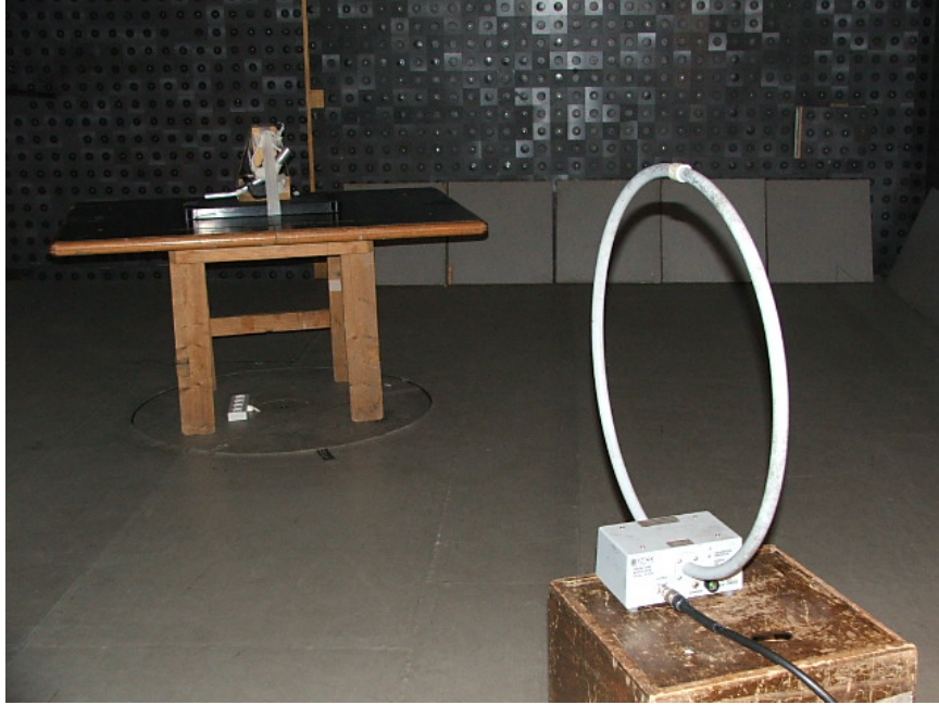
Photograph No.1 Radiated emissions measurement setup in the anechoic chamber below 30 MHz