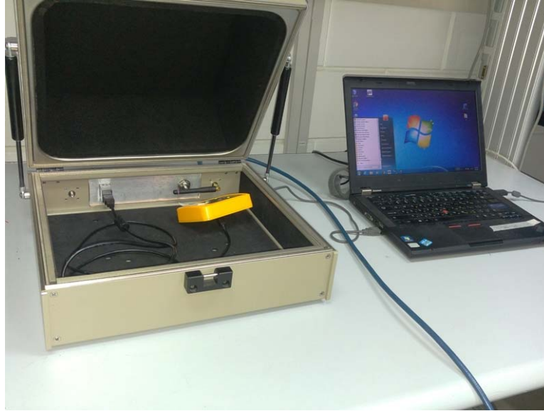
Photograph No.1 OBW measurement setup