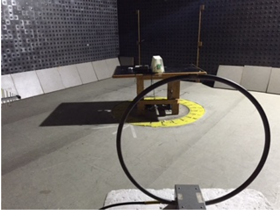
Photograph No.1 Radiated emissions measurement setup in the anechoic chamber below 30 MHz