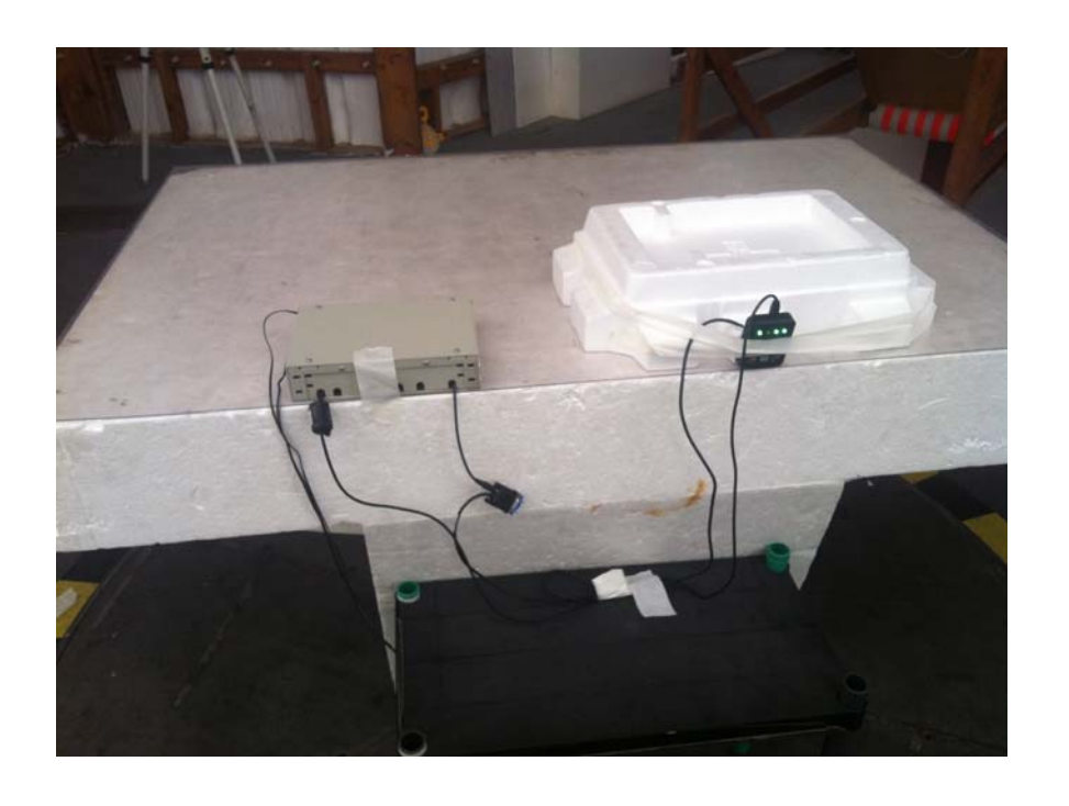
Photograph No.3 Radiated emissions measurement setup, EUT close view