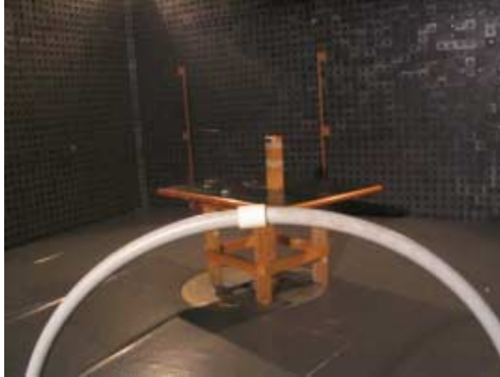
Photograph No.1 Radiated emissions measurement setup in the anechoic chamber with loop antenna