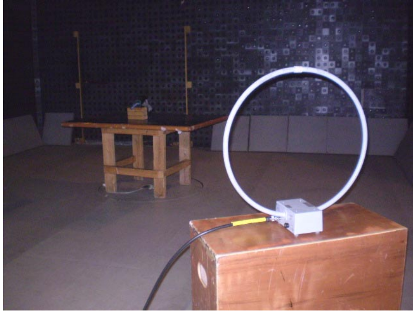
Photograph No.1 Radiated emissions measurement setup in the anechoic chamber below 30 MHz