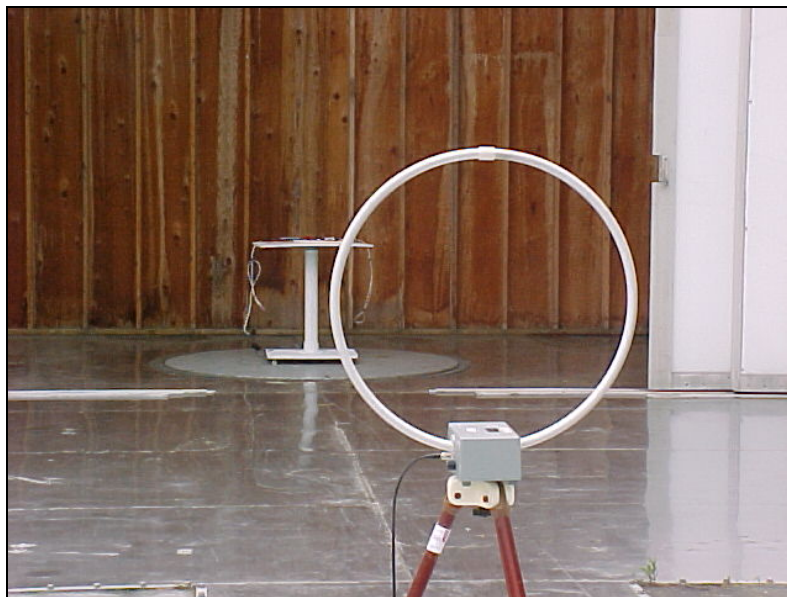
View of the EUT during Radiated Emission Testing on the 10 Meter OATS, measurement of Low Frequency Signals