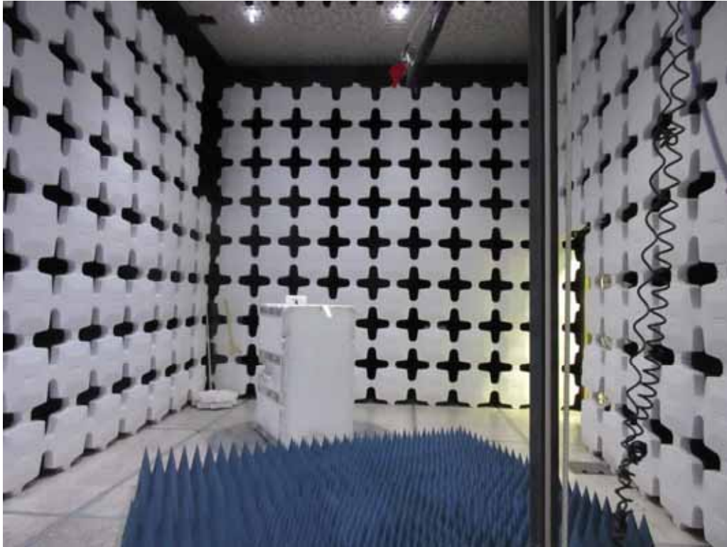
Test Setup for Radiated Emissions, 1 to 5GHz – Horizontal Polarization