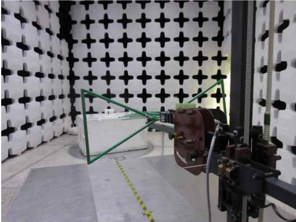
Test Setup for Radiated Emissions, 30MHz to 1GHz – Horizontal Polarization