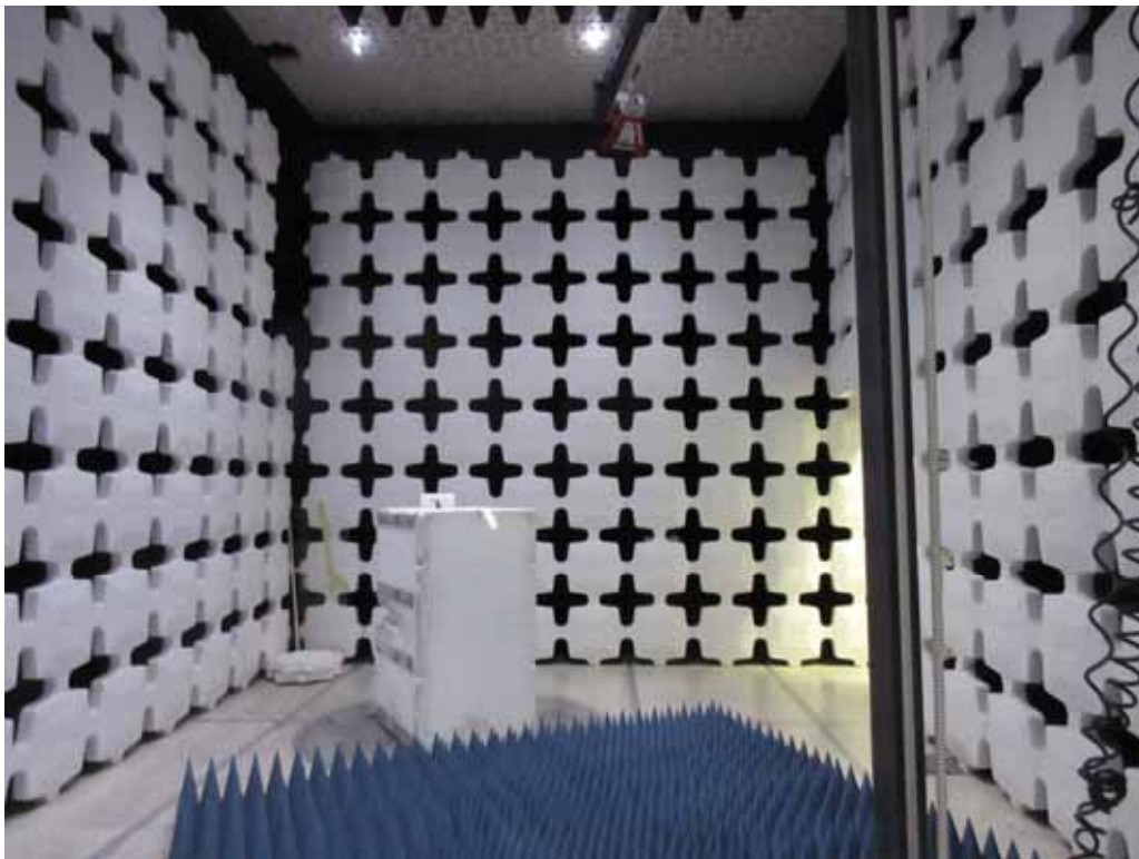
Test Setup for Radiated Emissions, 1 to 5GHz – Vertical Polarization