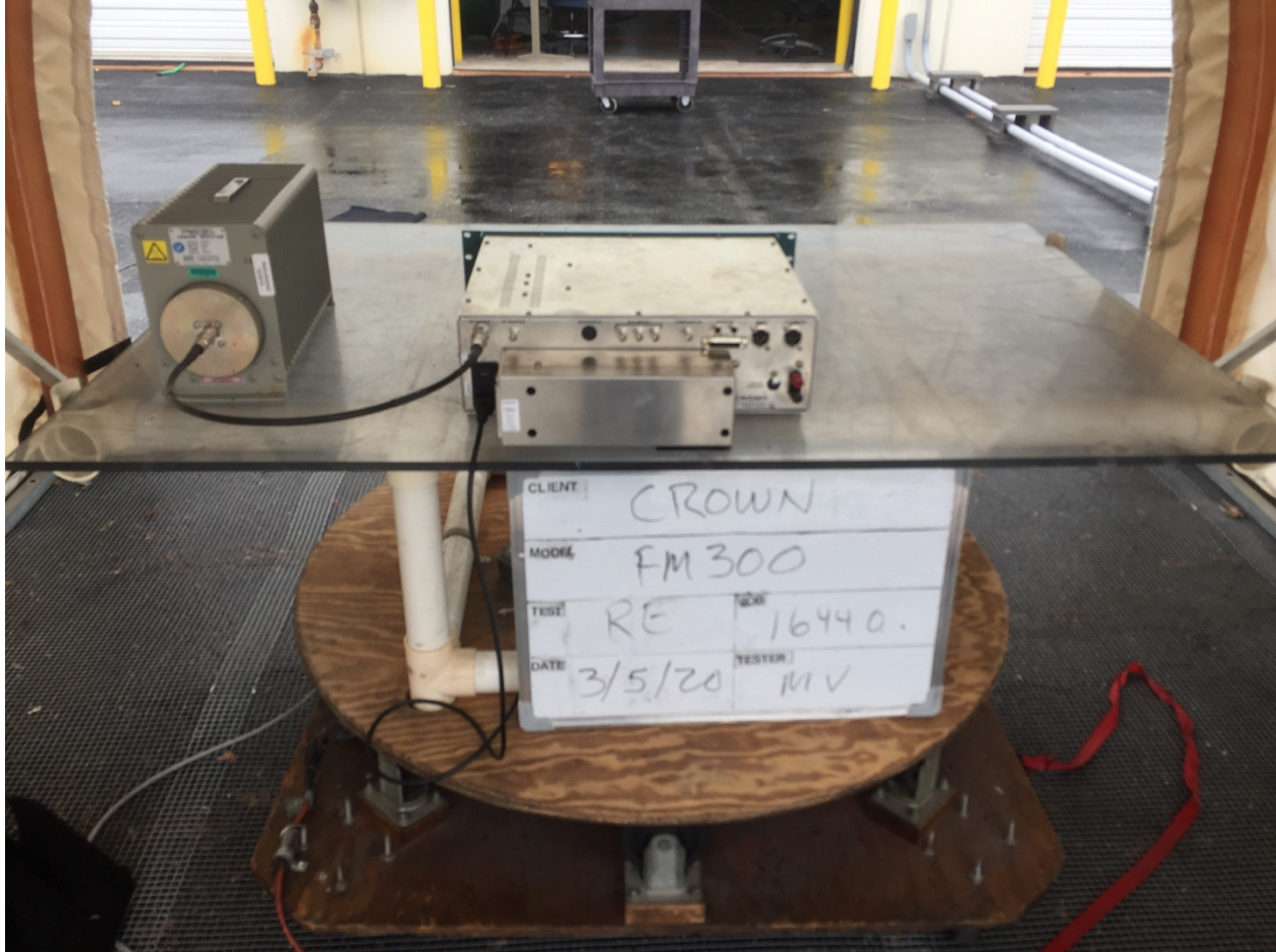
Radiated Emissions Rear