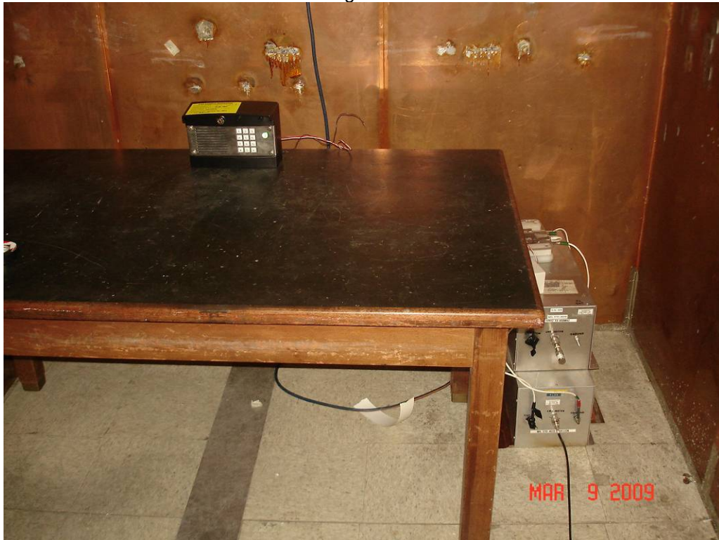
Test Set-up for Conducted Emissions