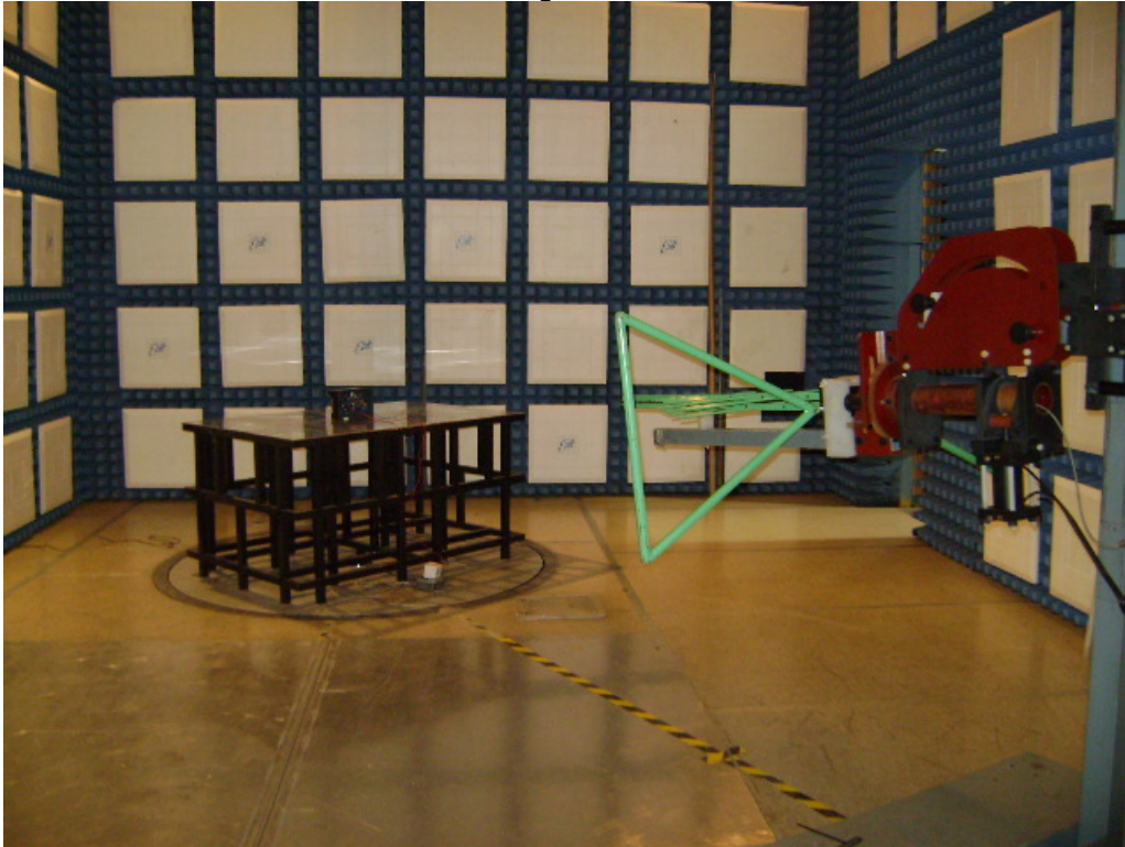
Test Set-up for Radiated Emissions – Horizontal Polarity