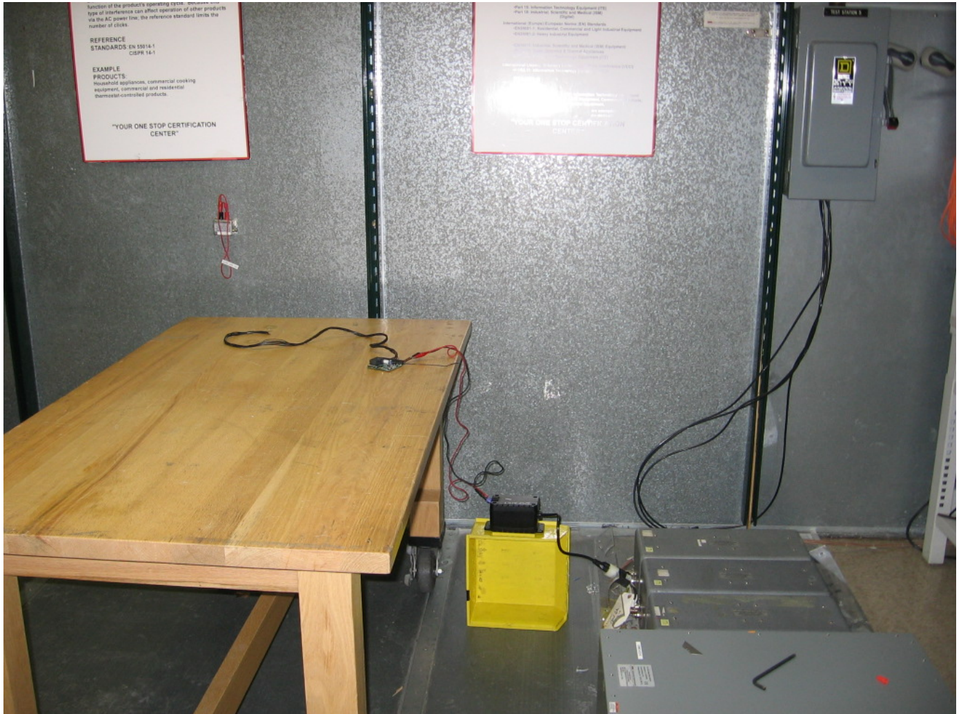
Figure 1 Test Setup for Conducted Emissions