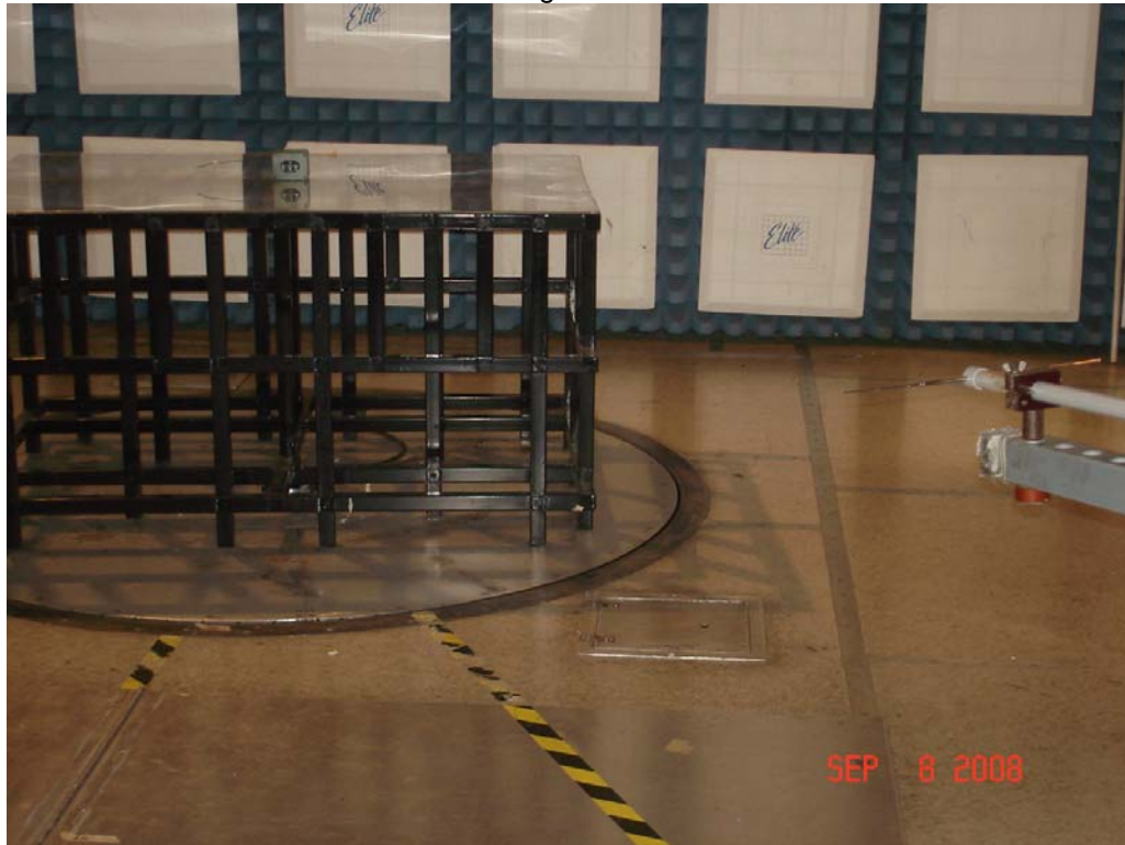
Test Set-up for Radiated Emissions – Horizontal Polarization