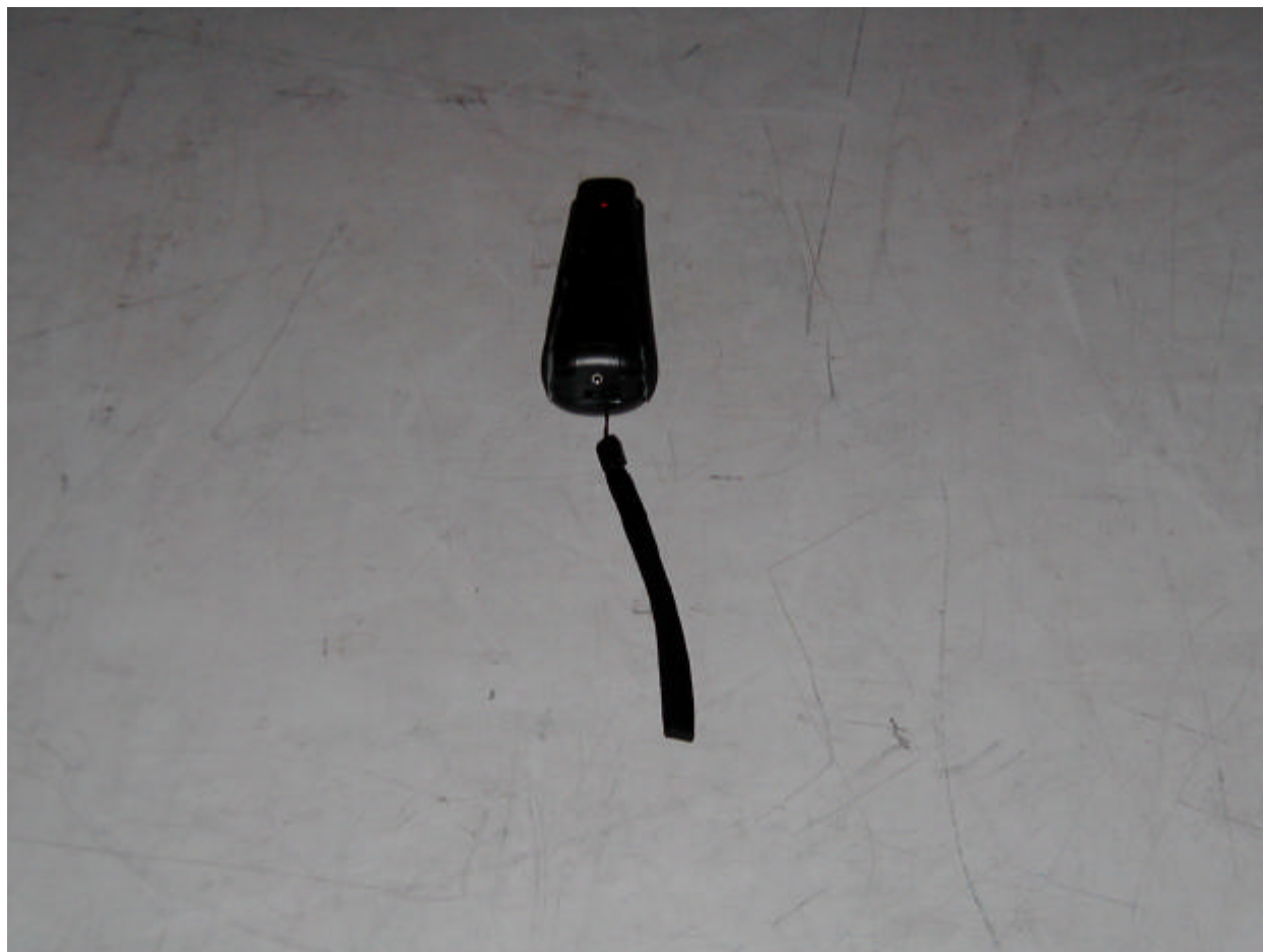
EXHIBIT 3: Radiated Emissions Test Configuration Photographs