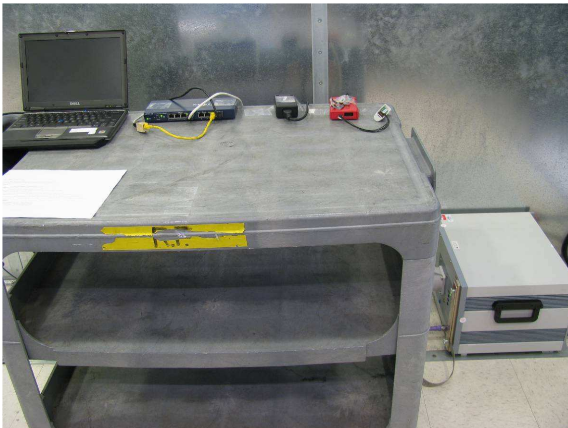
Conducted Power Port Emissions (Front)