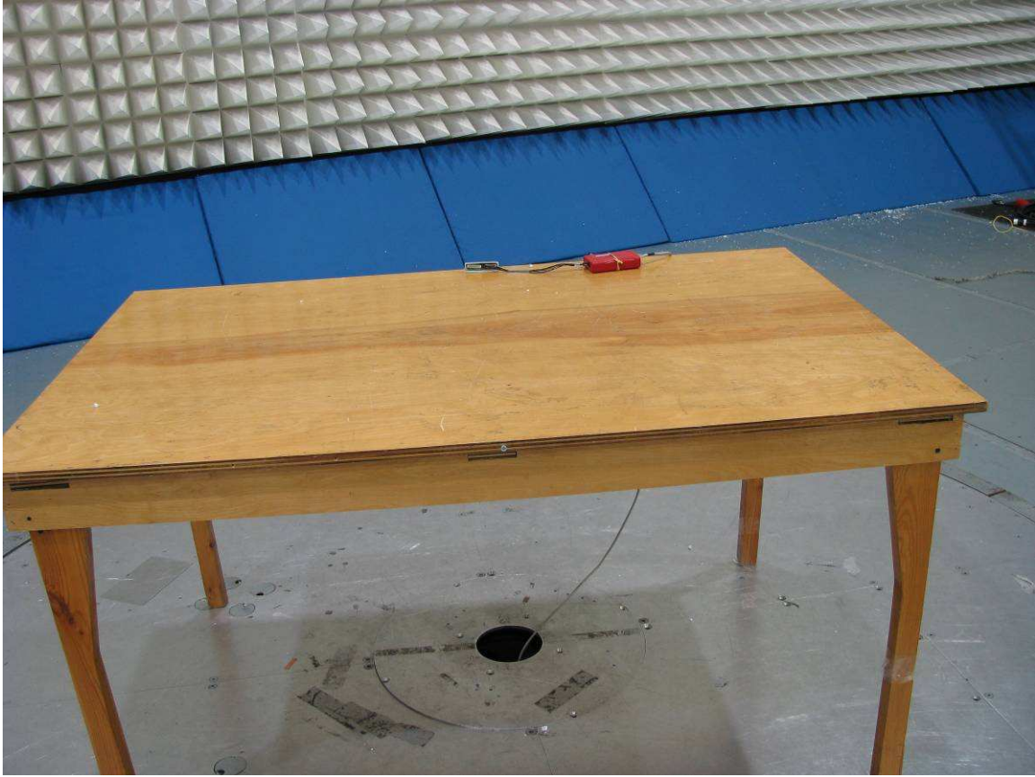
Radiated Emissions (Back)