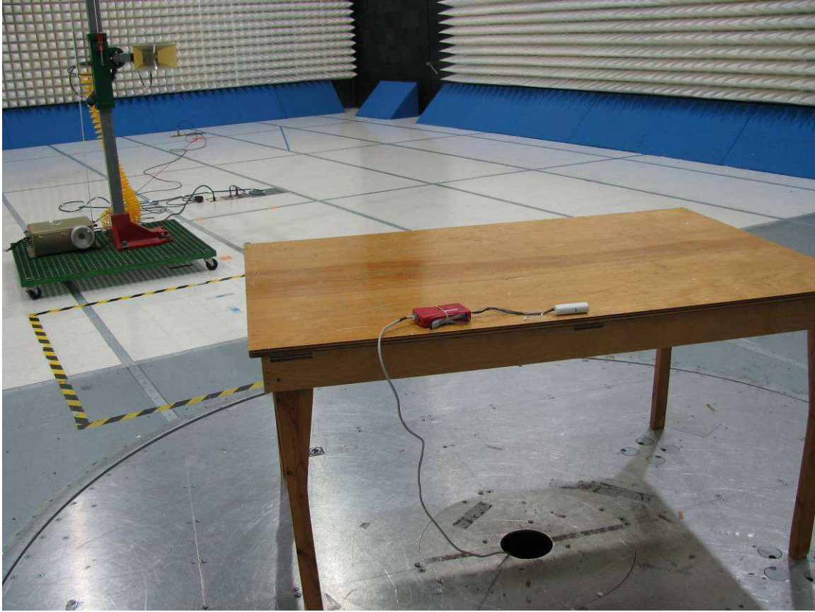
Radiated Emissions (Front)