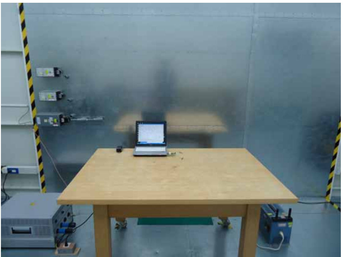
FRONT VIEW OF CONDUCTED MEASUREMENT

10.1.Photos of Conducted Disturbance Measurement