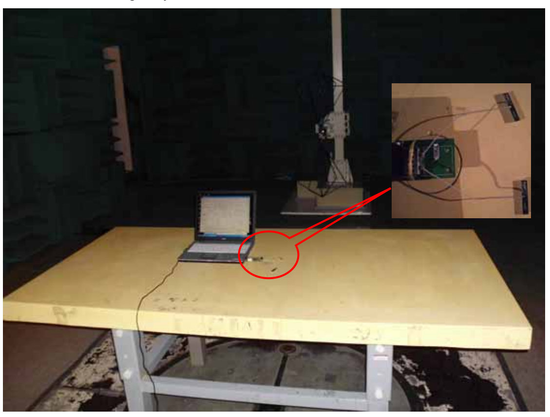
10.2.2. Frequency Above 1GHz