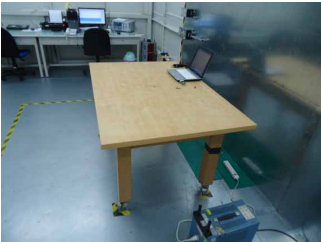
BACK VIEW OF CONDUCTED MEASUREMENT