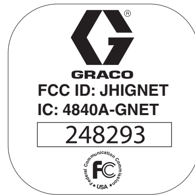
Scale - 4:1