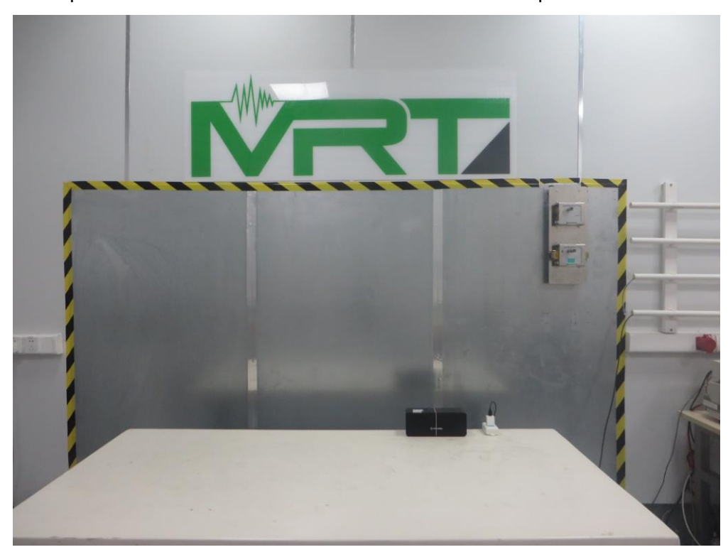
Description: Back View of Conducted Emission Test Setup for Power Port

Description: Front View of Conducted Emission Test Setup for Power Port