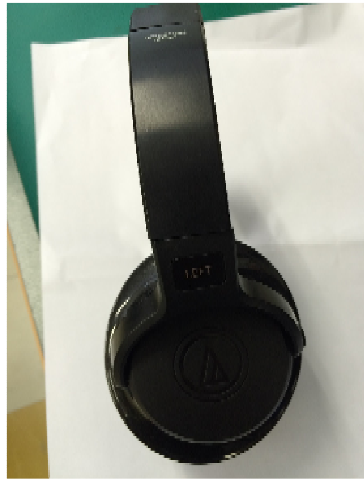
fig4 : Side(Left)