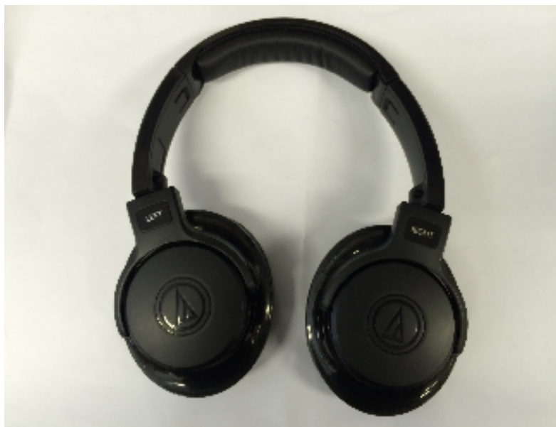
fig1 : Front