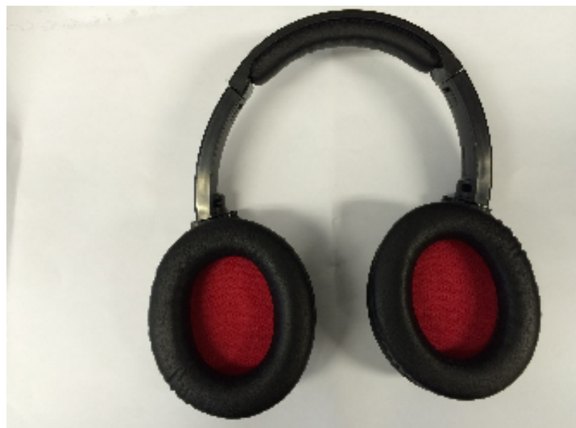
fig2 : Back