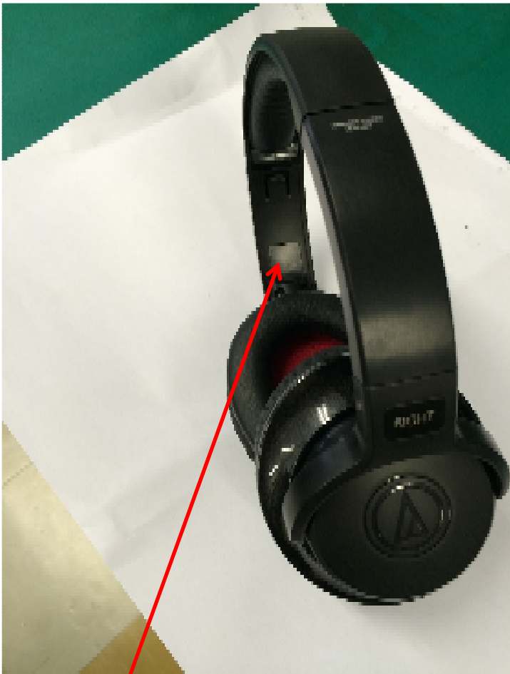
fig3 : Side(Right)