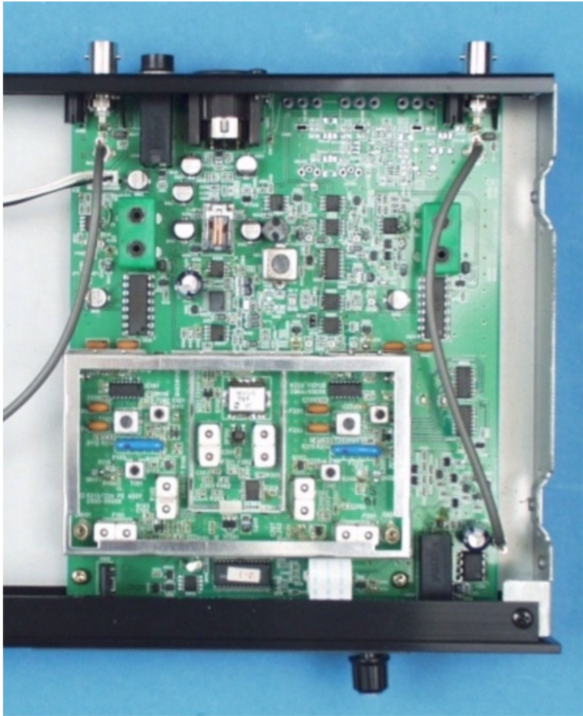
Circuit Board without Shield