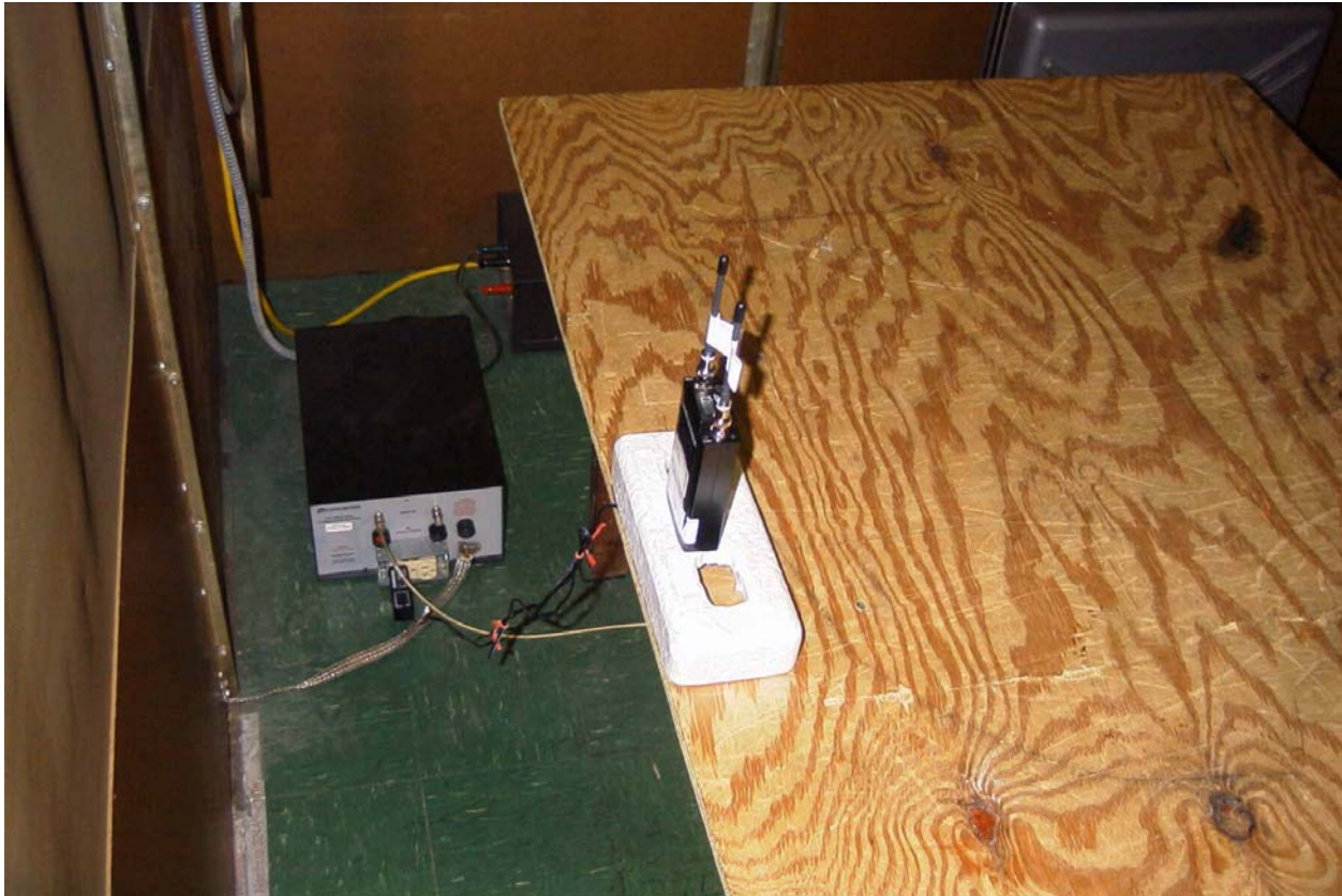
POWER LINE TEST SETUP PHOTO

APPLICANT: AUDIO TECHNICA CORPORATION FCC ID: JFZR1810D REPORT #: V:\A\AudioTechnica_JFZ\3239AUT6\3239AUT6TestReport.doc