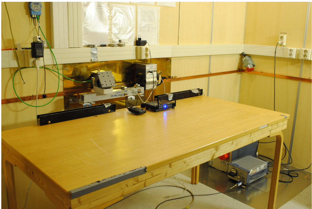
Power-line Conducted Emissions test