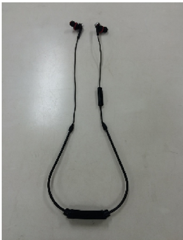
fig1 : Entire