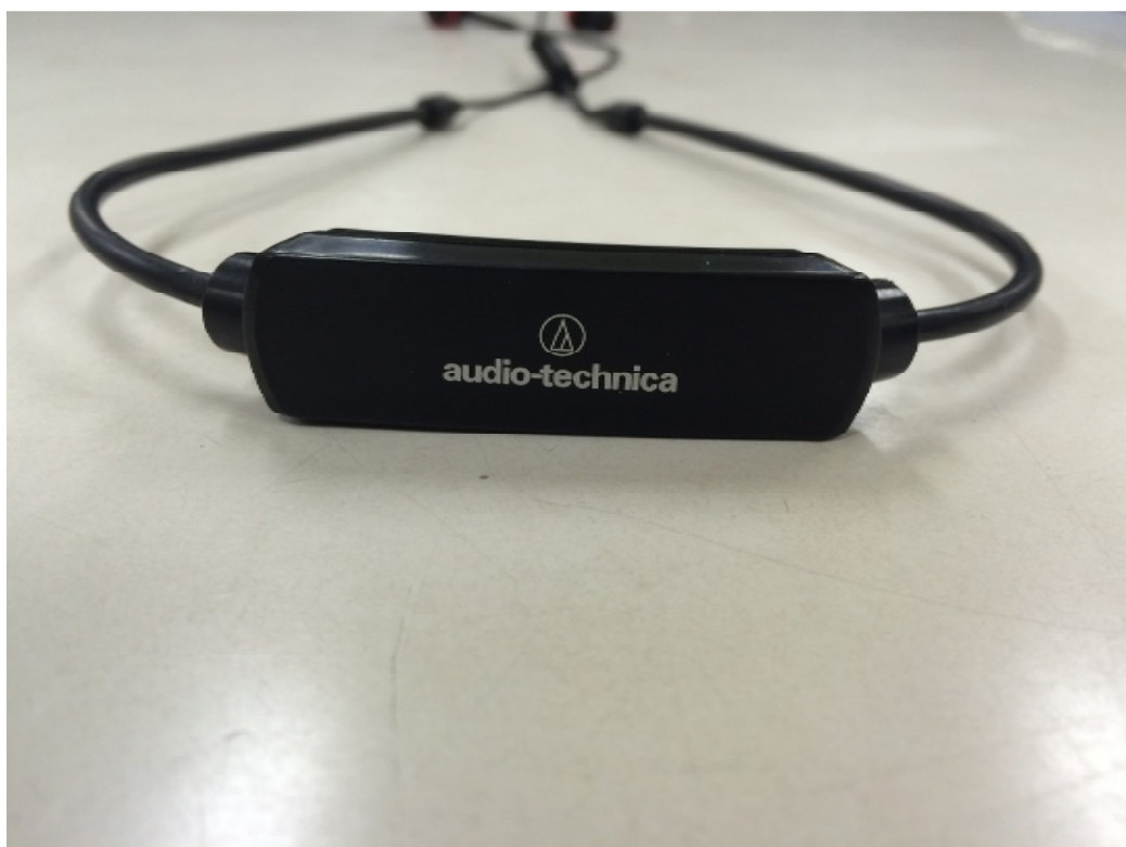
fig2 : Front