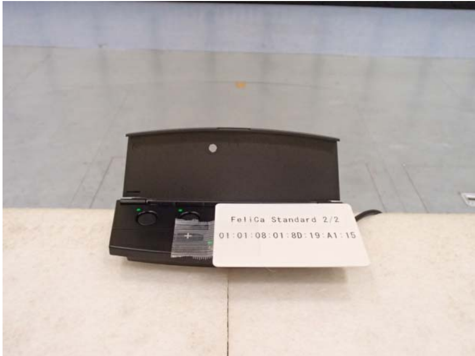
With Tag (Worst Case Position)