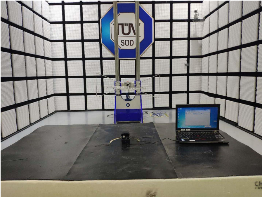
Radiated Emission Test 1GHz-18GHz