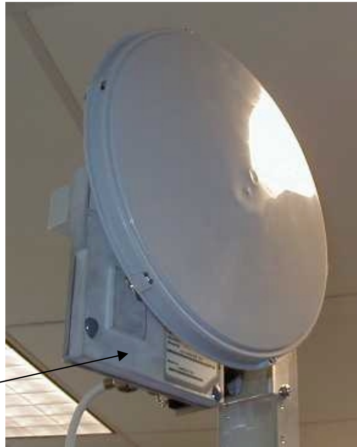
Exhibit 2 - Location of RF Exposure Label