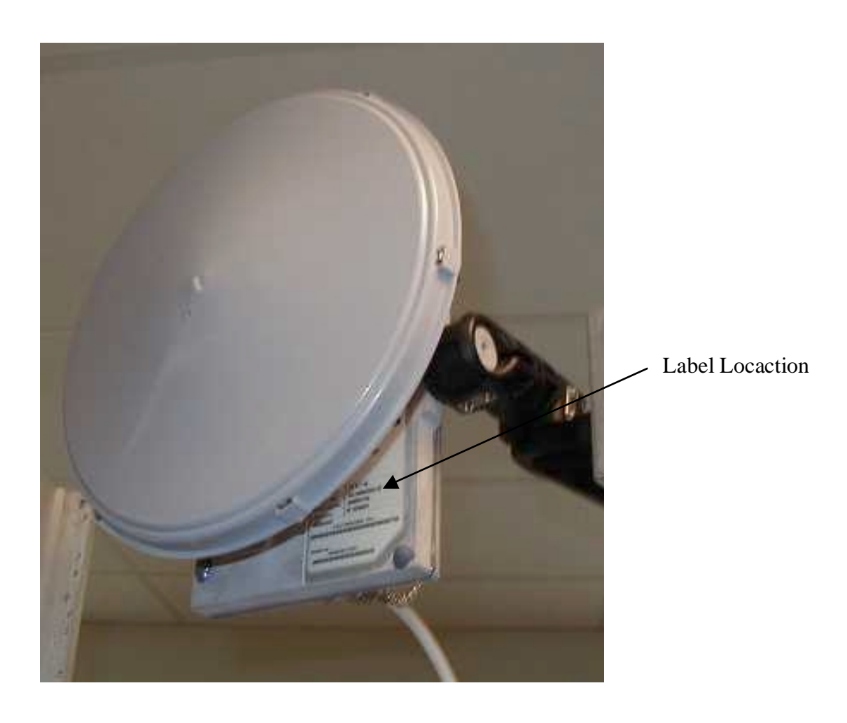
Exhibit 4 - Location of Equipment ID Label