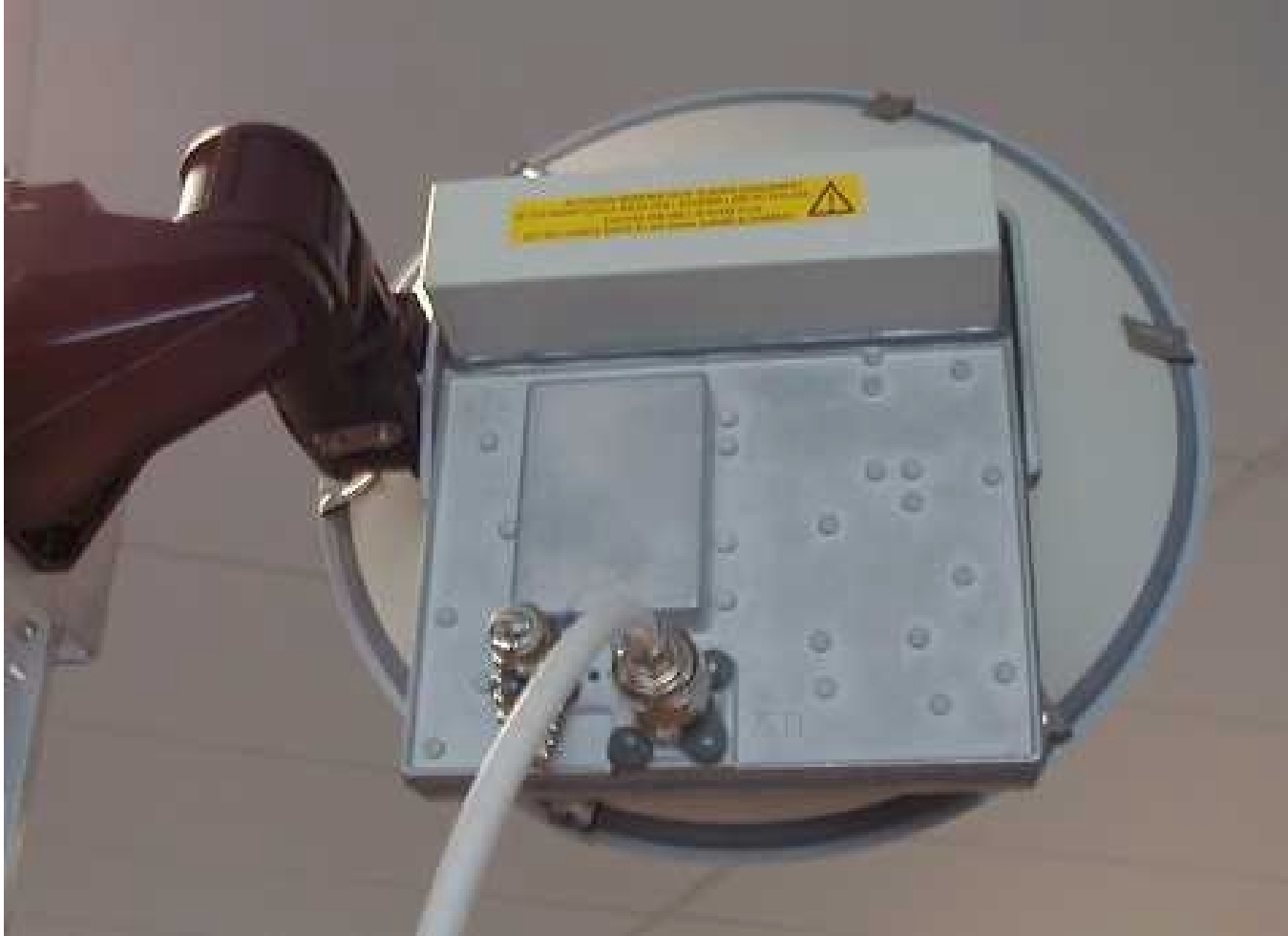
Exhibit 2 - Rear View