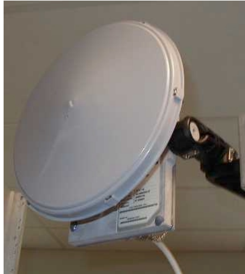
Exhibit 1 - Front View