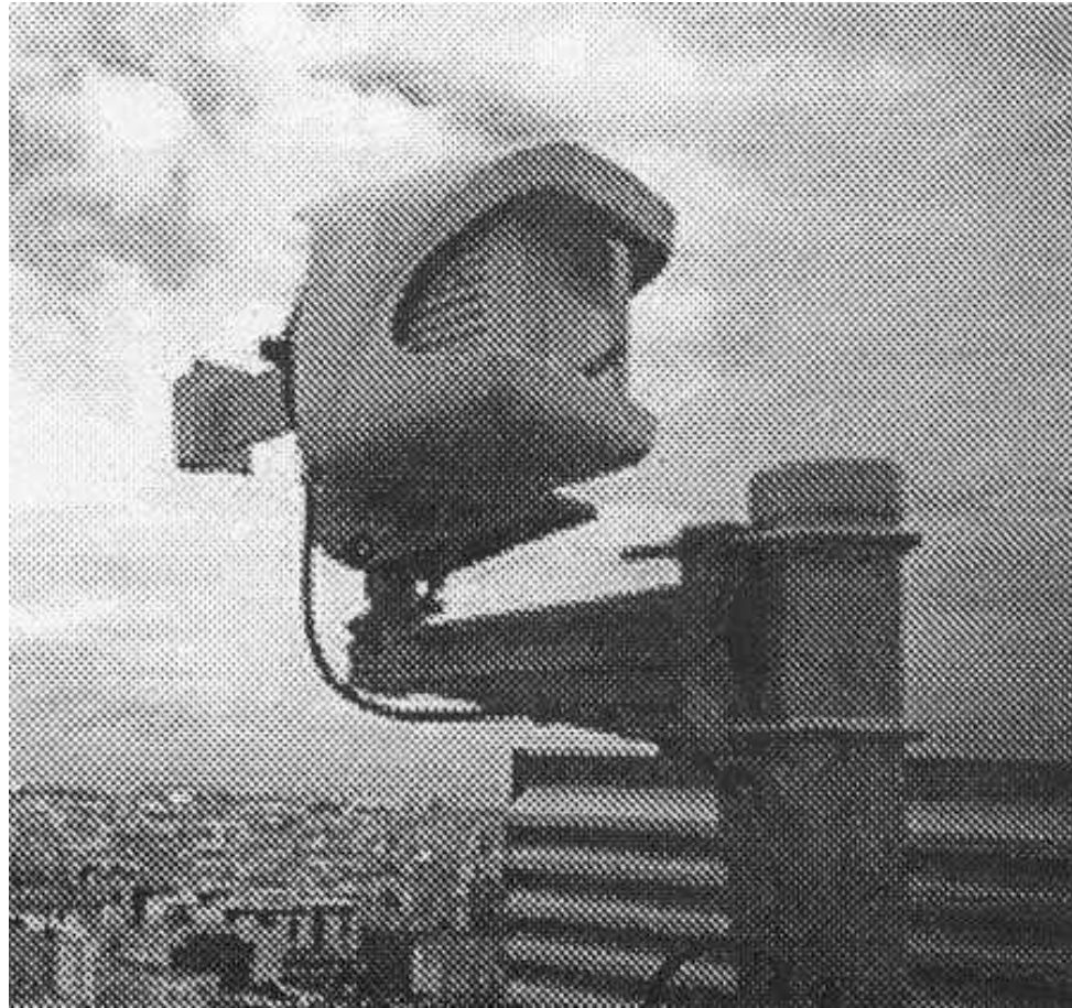
Exhibit 2 - Rear View