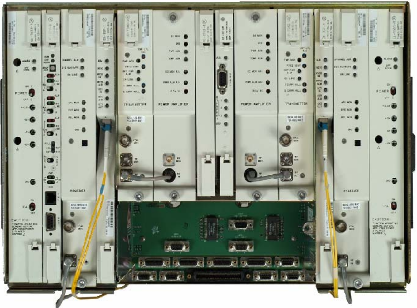
Figure 2-1 Typical MDR-8000/i/s/u Series Microwave Digital Radio