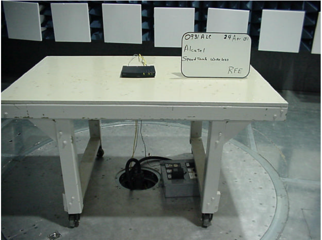
Figure 1 - Preliminary Radiated Emissions Test Setup (Chamber - Front)