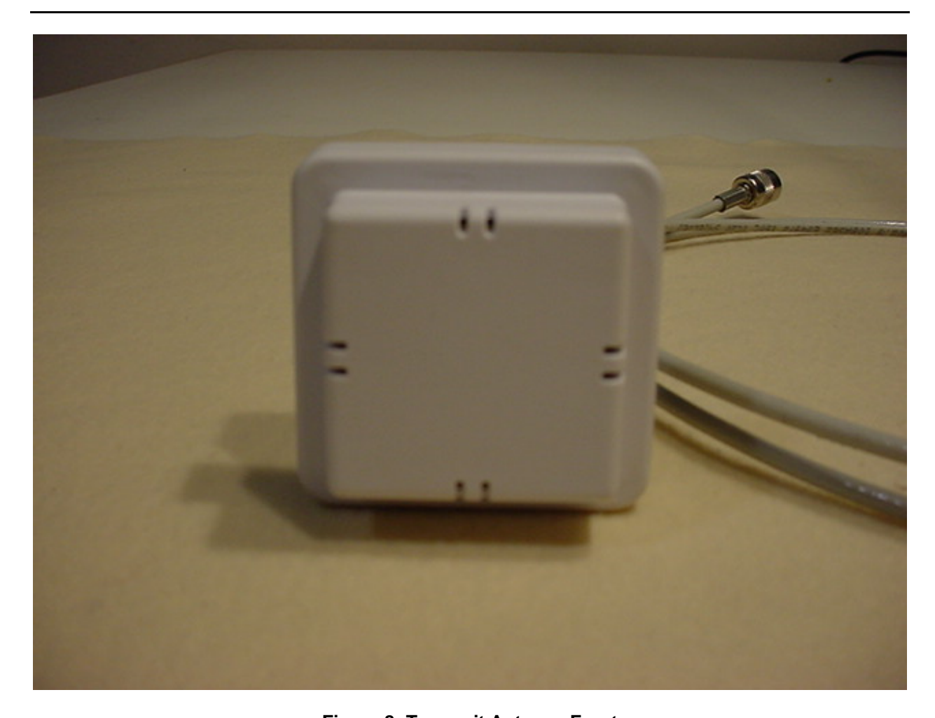
Figure 8: Transmit Antenna Front