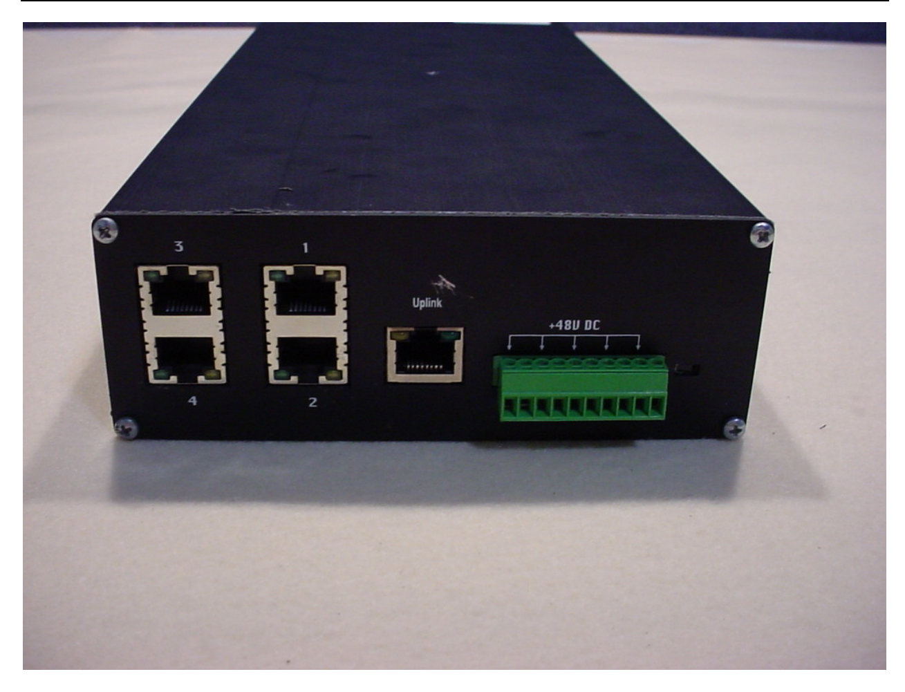
Figure 6: EUT Rear