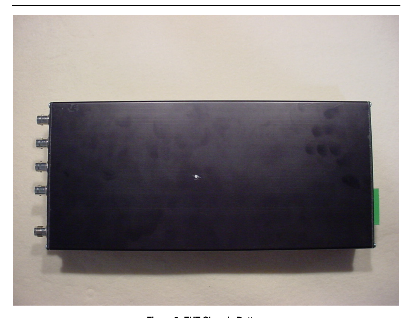
Figure 3: EUT Chassis Bottom