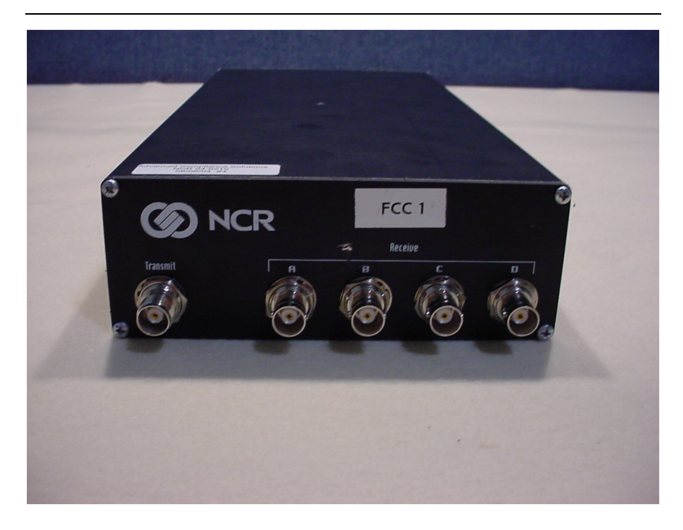
Figure 5: EUT Front