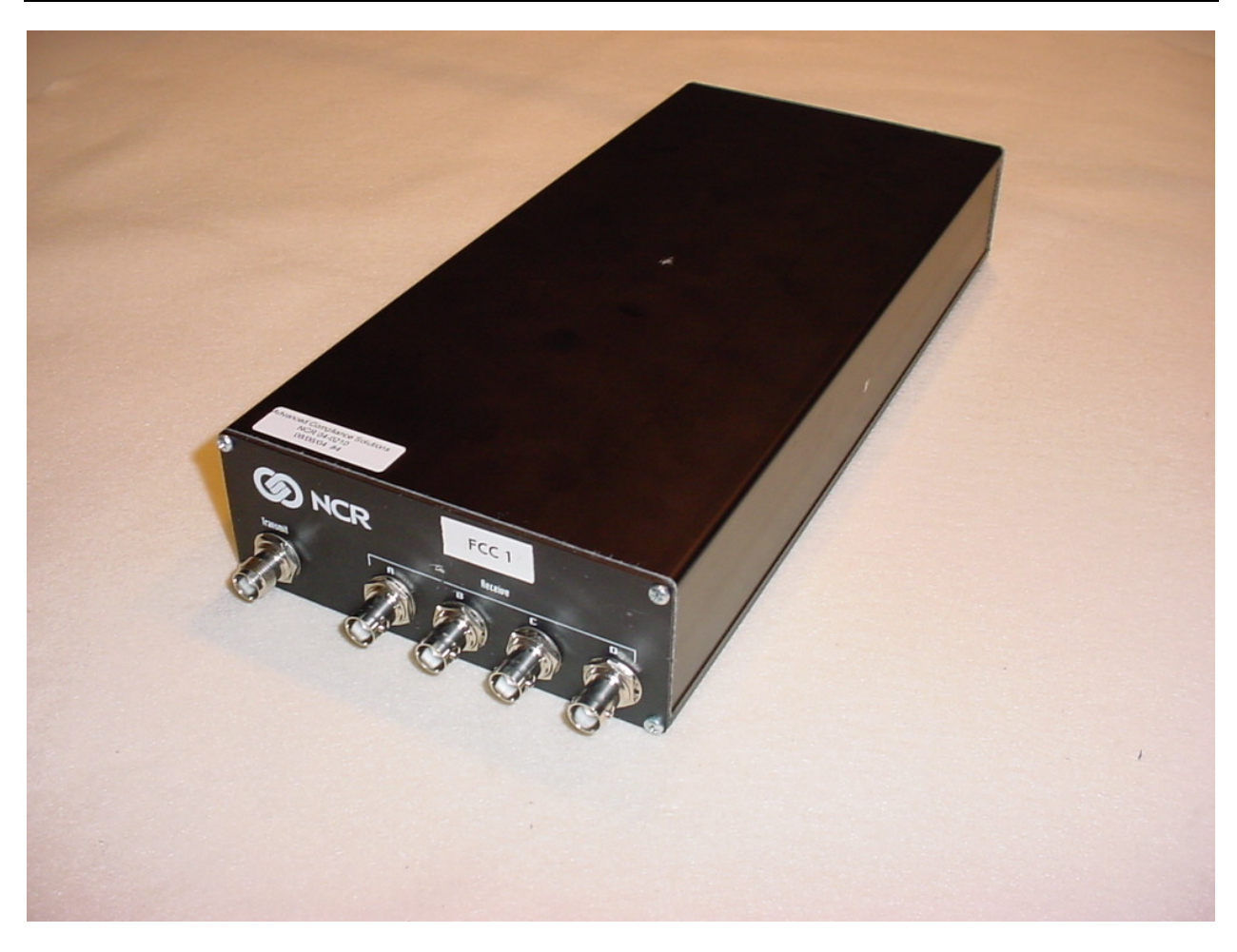
Figure 1: EUT 3D Front