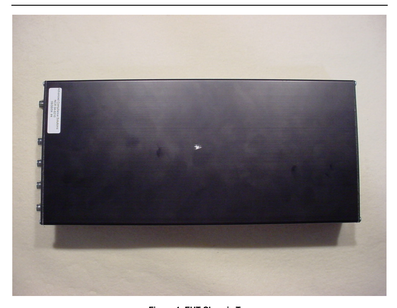
Figure 4: EUT Chassis Top