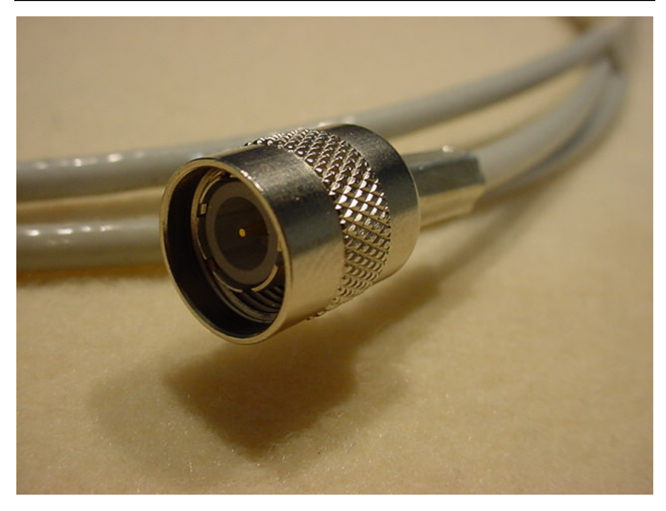
Figure 9: Transmit Antenna Connector (TNC)