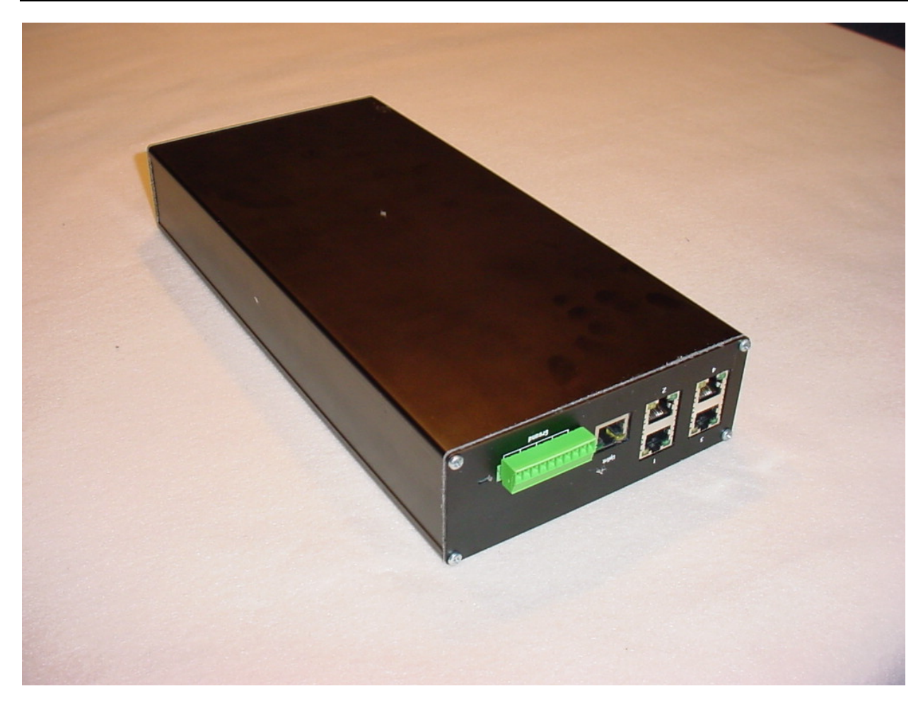
Figure 2: EUT 3D Rear