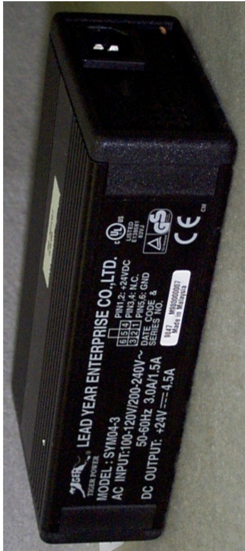
Photo 1. EUT, Power Supply Front View