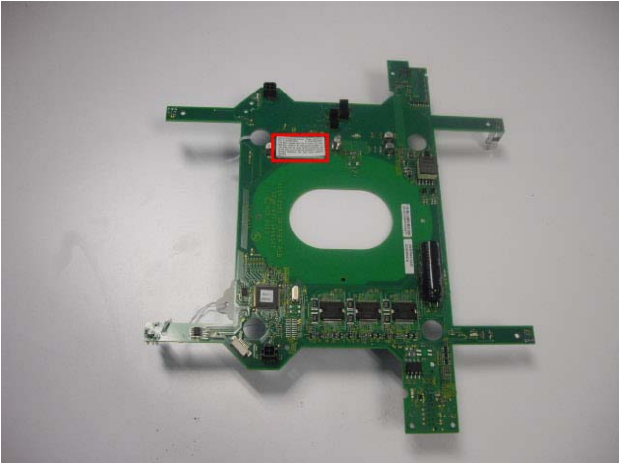
Figure 2: Label Location