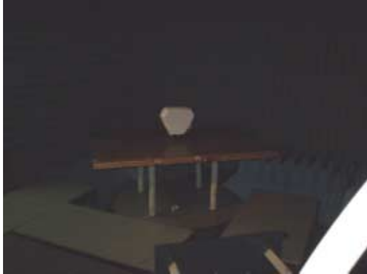
Photograph No.1 Spurious emissions field strength measurement setup below 30 MHz