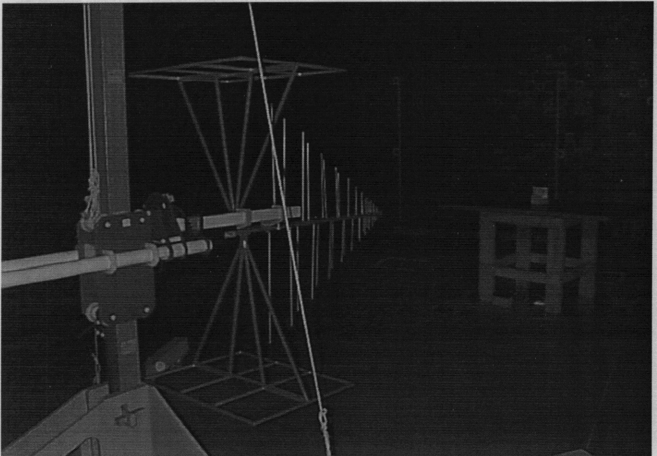
Radiated Emission Measurements Setup Photograph 3.1.1