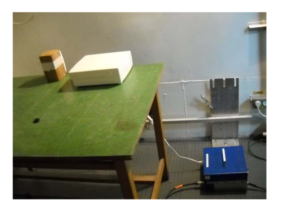
Photograph No.5 Setup for conducted emission measurements at the EUT power port