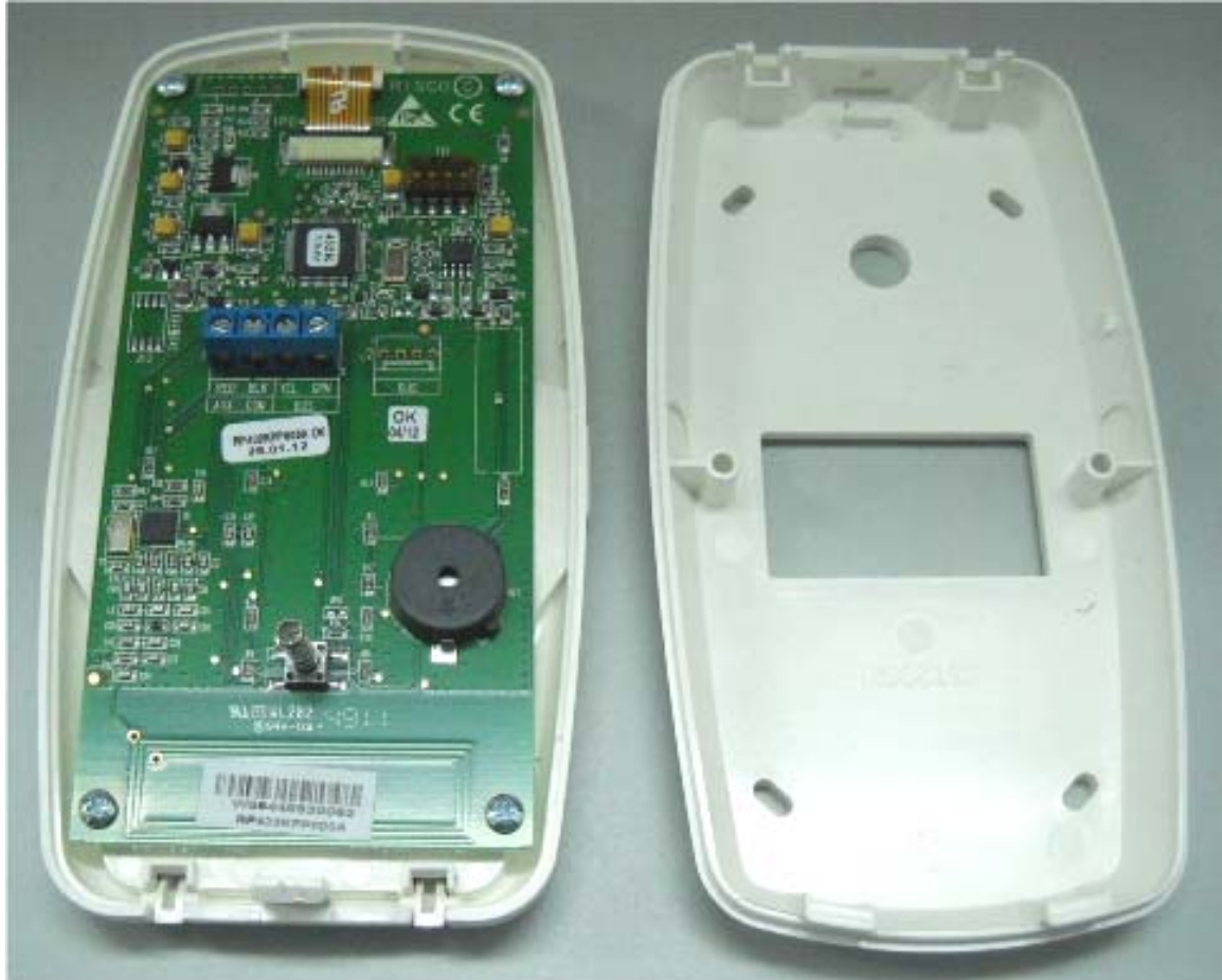
Photograph No.1 Keypad internal view