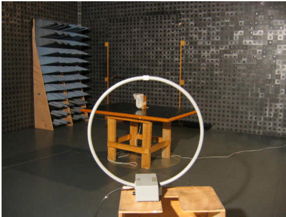
Photograph No.1 Spurious emissions field strength measurement setup below 30 MHz