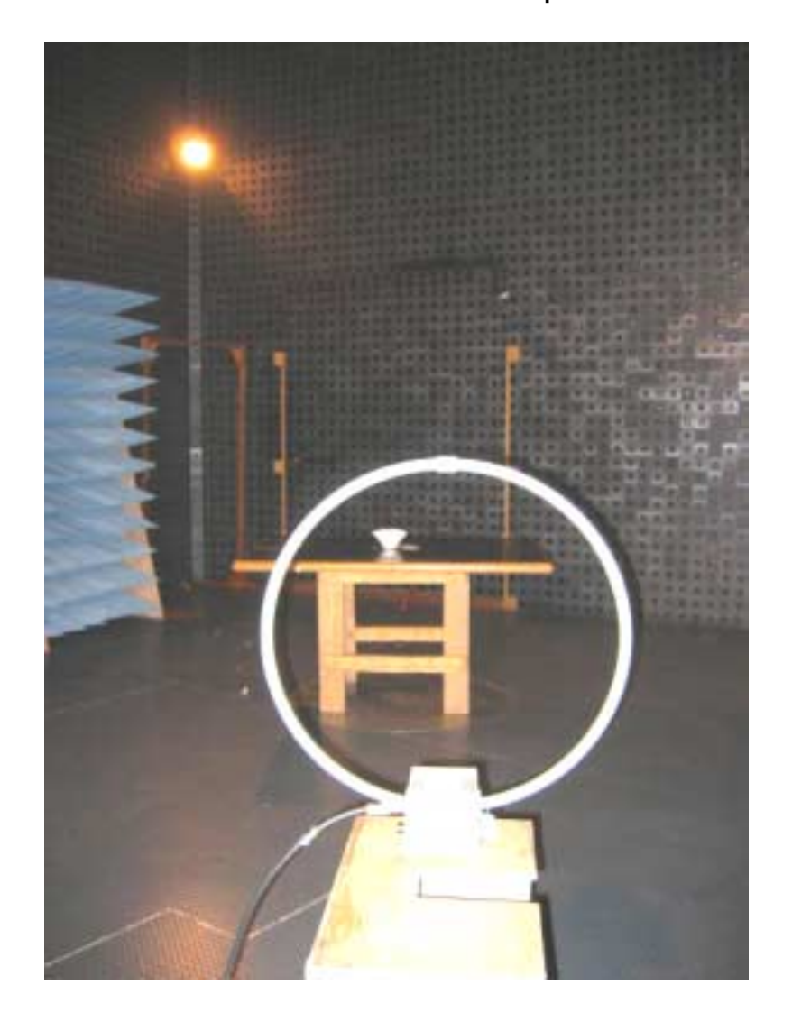
Photograph No.1 Radiated emissions measurement test setup below 30 MHz