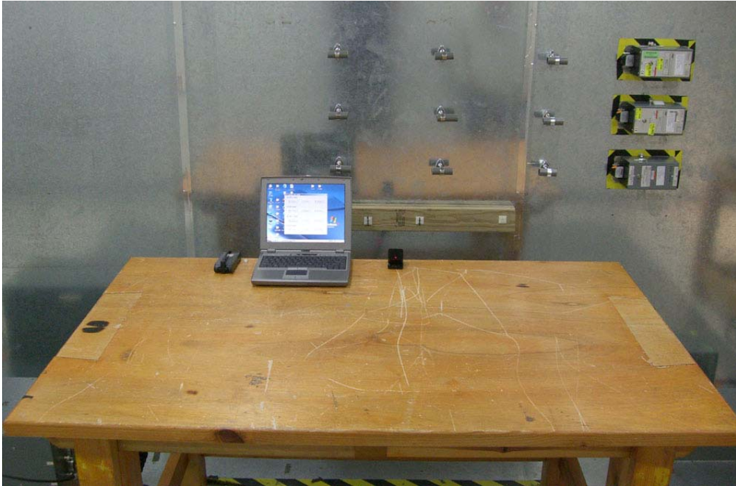
The Front View of Highest Conducted Set-up For EUT